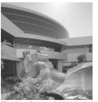
Technology: CSUN's joint The Arts: The College of venture with MiniMed Corp. culminated with the opening of the company's $80 million headquarters complex on the university's North Campus.