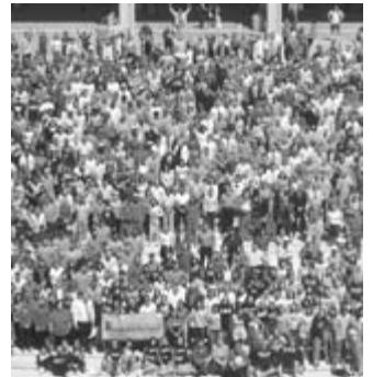
Enrollment: For fall 2001, CSUN enrollment topped the UCLA Bruins at Pauley 30,000, its highest level in a decade, and the university received a record 25,000 applications from students seeking to attend.