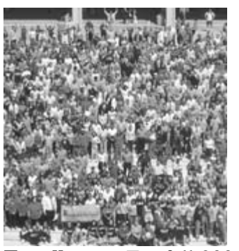
Athletics: The Matadors men's basketball team beat Pavilion and advanced to the NCAA tournament for the first time in school history.