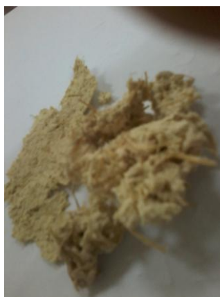
Figure 3.- Ampelodesmos mauritanicus after chemical treatment

The hollocellulose obtained were dissolved in 80 ml of KOH (25 wt. %), the mixture was kept under stirring for 15 hours, then the paste was filtrated and washed till eliminate all NaOH with distilled water, second wash was done with diluted acetic acid then ethanol finally the cellulose was obtained after dried.