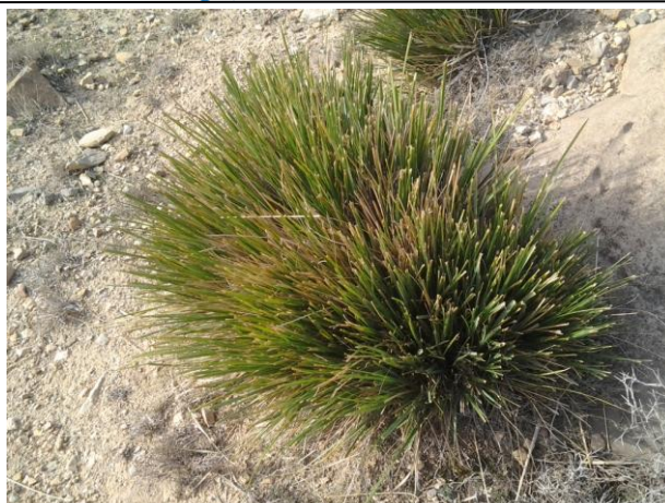
Figure 1.- Grass Ampelodesmos mauritanicus (Diss)