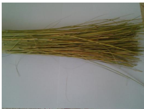
Figure 2.- Raw Ampelodesmos mauritanicus Stem

m_3 : is the weight of the crucible and of the residue after calcination to constant weight (g). The weight difference between the mass of dry matter and the mass of Mineral content corresponds to the mass of organic matter.