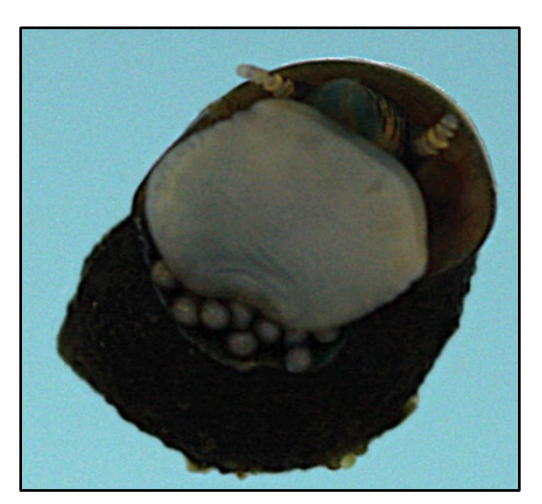
Figure 2. Female L. arkansensis with clutch. Figure taken from Whelan et al. (2015)

Female Leptoxis have an egg-laying sinus on the right side of the foot; males lack external sex organs (Burch 1982). Leptoxis species lay eggs in one of three patterns: a circular clutch, a line, or single eggs. L. arkansensis displays a unique variant of the single egg strategy: females collect the eggs in a clutch near their foot and drag the entire clutch, depositing individual eggs from the clutch onto the substrate (Figure 2; Whelan et al. 2015). L. arkansensis lays eggs on the undersides or sides of hard, clean substrates (such as coarse sediment, bedrock, or woody debris without siltation or vegetation) (Whelan et al. 2015). Once egg laying begins, all Leptoxis species lay eggs for 60-90 days (Whelan et al. 2015). Eggs are approximately 0.3 mm in diameter (Whelan et al. 2015). In the lab, eggs hatched 14 days from oviposition with over 98% success rate (Whelan et al. 2015).