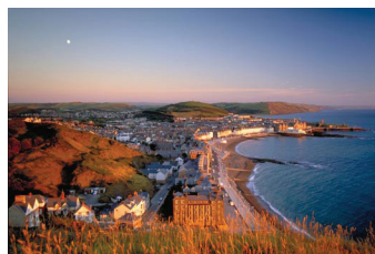
Aerial photo of Aberystwyth, Wales