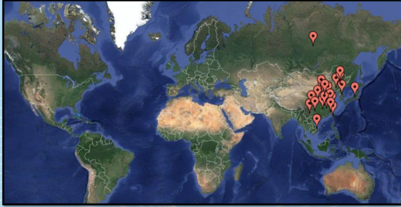
Image credits: map created with easymapmakers.com, Background image: NASA, Terrametrics 2016