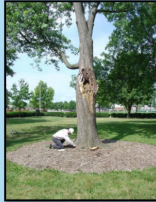
Image credits: visual tree inspection - Andrew Koesser, International Society of Arboriculture, - Bugwood.org, #5375292