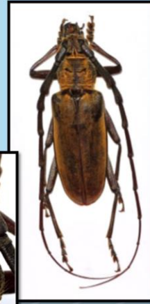
deep mountain longhorn beetle ( Neocerambyx raddii ) Blessig & Solsky, 1872; deep mountain longhorn beetle ( Neocerambyx raddii ) Blessig & Solsky, 1872