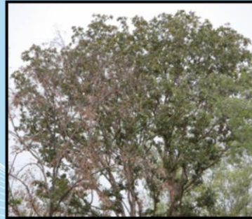
Image credits: twolined chestnut borer ( Agrilus bilineatus) (Weber, 1801) - ; crown decline - ; dieback