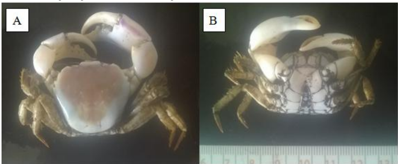
Figure 3 Eurycarcinus orientalis male general view

Carapace: moderately wider than long, largest male specimen 19.5 mm × 23.5 mm; smooth and shiny surface with antero-lateral borders less than two-thirds the length of the postero-lateral borders (Figure 3A). Antero-lateral borders with 2 sharp teeth and an indentation separating the anterior margin. The Carapace is pinkish purple, whitish at the edge, finger and thumb of chela slight darker.