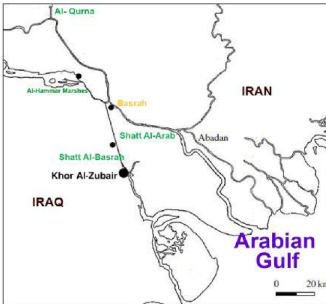
Figure 1 Sampling sites, indicating the position of the Khor Al-Zubair in the northern part of the Arabian Gulf.

Specimens are preserved in 70% alcohol and deposited in the marine science center (MBD-MSC) (collection number: 40, 41 for P. convexus and E. orientalis , respectively).