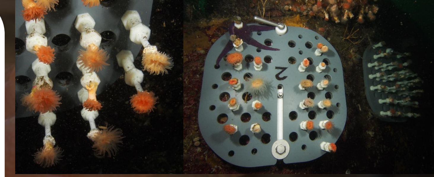
Figure 1: D. dianthus corals glued on plastic screws and attached to holders to re-transplant them in their natural orientation on the fjord wall.