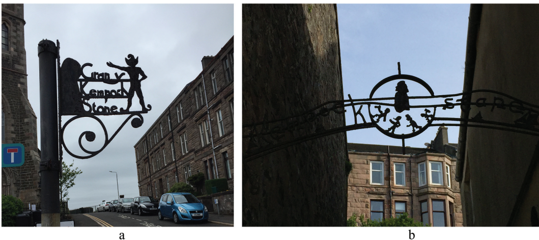
Figure 3. Ironwork sign 1 to the Kempock Stone' and 'Figure 3b Ironwork sign 2 to the Kempock Stone'.

More distinctive are two ironwork signs (see Figure 3) The first is sited at the entrance to the stairs that lead up to the megalith from Kempock Street and is composed of three iron bars affixed to the walls of the narrow passage with a circle wrought in the centre. Either side of the centre, are the words ‘Kempock’ and ‘Stane’ that enclose an approximation of the stony form and four circling figures performing a ritual. The other iron sign is attached to a pole opposite the extension of Burgh