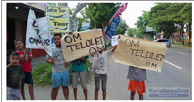
Figure 1. “Om telolet Om.”

It is striking to see a salient language of urgency, such that anti-LGBT forces constantly invoked notions of an ‘LGBT Crisis’, ‘LGBT Emergency’, and even ‘LGBT plague’. 23 Crucially, these anti-LGBT events were linked to a broader right-wing movement that has targeted women’s rights, the rights of religious minorities, and the very existence of a plural public sphere (Katjasungkana and Wieringa, 2016; Paramaditha, 2016; Postill and Epafras, in press). LGBT Indonesians can serve as ‘canary in the coal mine’ for an Indonesia that is struggling to live up to its motto of ‘unity in diversity’.