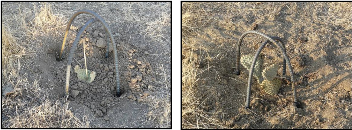
Figure 6. Cattle guards placed over translocated Bakersfield cactus at the Bena Landfill Conservation Area, Kern County, California.

discourage cattle from trampling the plants (Figure 6). To test efficacy, cattle guards were placed over clumps and pads in 3 plots while no guards were installed on 2 plots.