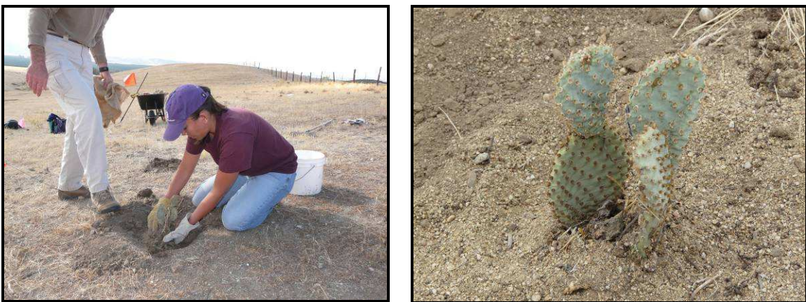
Figure 5. Translocated Bakersfield cactus clumps at the Bena Landfill Conservation Area, Kern County, California.

For each clump, we dug a planting hole that was approximately 30 cm (1 ft) in both depth and width. Each clump and its soil were removed from their bucket by grasping and lifting the fabric that was lining the bucket. Clumps were transferred into the planting holes by hand and the holes were filled in with a combination of soil transported from the source population site and soil native to the introduction site (Figure 5). Clumps were transplanted into dry soil and watered after one week (Showers 2005).