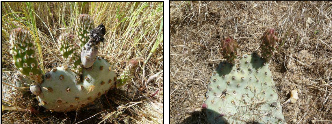
Figure 7. New pads on a translocated Bakersfield cactus clump (left) and pad (right) at the Bena Landfill Conservation Area, Kern County, California.

Among the clumps, 8 of the 10 (80.0%) produced new pads in spring of 2010 (Figure 7). These 8 clumps produced 20 new pads for a mean of 2.5 per clump (range 1-4). In spring of 2011, 9 of the 10 clumps produced 23 new pads for a mean of 2.6 per clump (range 1-7). Among the translocated pads, 20 of the 22 surviving pads produced 37 new pads in spring 2010 for a mean of 1.9 per translocated pad (range 1-5). In spring of 2011, 7 of the 12 surviving translocated pads produced 14 new pads for a mean of 2.0 per translocated pad (range 1-4).