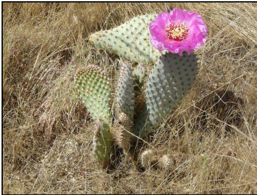
Figure 8. Flower on translocated Bakersfield cactus clump at the Bena Landfill Conservation Area, Kern County, California.

Among the 10 translocated clumps, 2 (20.0%) produced flowers in spring of 2010, and 4 (40.0%) produced flowers in spring of 2011 (Figure 8). Of the 4 plants producing flowers in 2011, 2 of these were the same plants that produced flowers in 2010. One of the 4 plants in 2011 produced 3 flowers while the other 3 plants produced 1 flower each. Among the translocated pads, one produced a flower in spring of 2010 and this same one produced another flower in 2011.