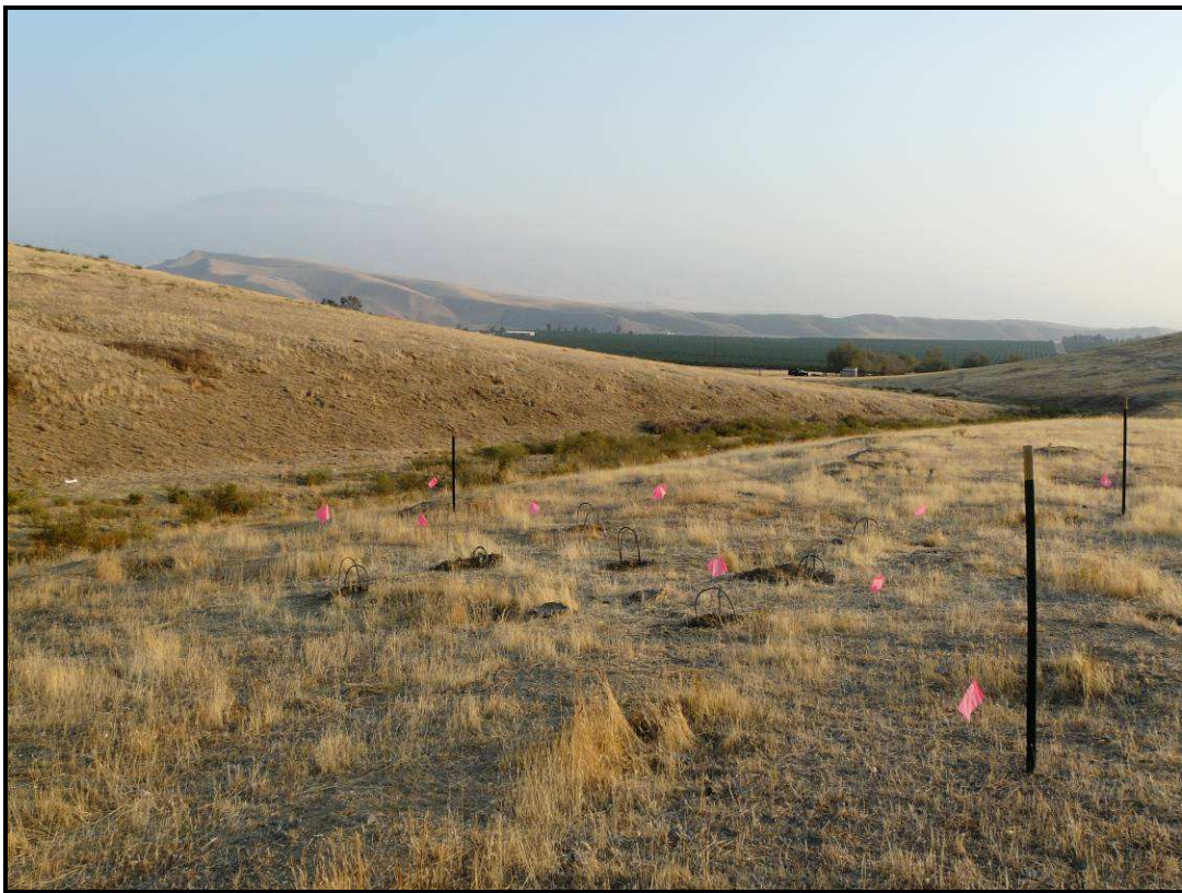
Figure 3. Bakersfield cactus reintroduction plot at the Bena Landfill Conservation Area, Kern County, California.

We introduced the cactus pads and clumps to the Bena Landfill Conservation Area on 20 October 2009. We established 5 plots at varying positions on an east-facing slope; each plot contained 5 pads and 2 clumps (Figure 3). We documented the location of each pad and clump (using their assigned codes) within each of the plots, which facilitated the monitoring of each individual over time.