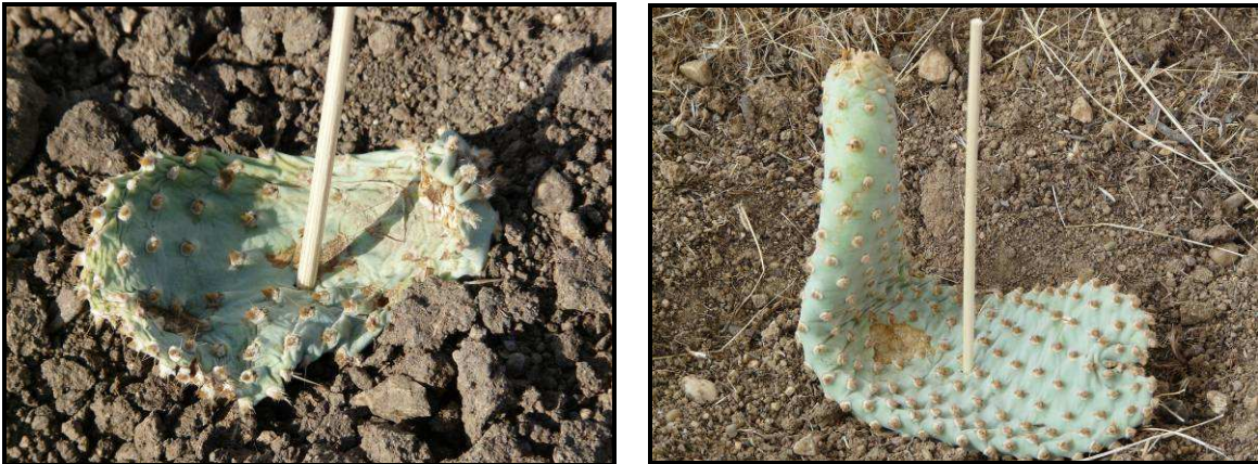
Figure 4. Translocated Bakersfield cactus pads at the Bena Landfill Conservation Area, Kern County, California.

contact with the soil surface. For any pad that did not have roots, we placed it in a position that maximized contact between the pad and the soil surface. We secured each pad in place with a wooden skewer (Figure 4). After each pad was installed, we photographed it to document its initial shape and appearance (e.g., green and fresh versus brown and dry).