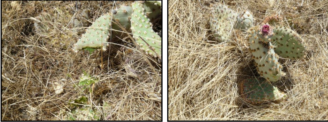
Figure 9. Cattle damage on Bakersfield cactus at the Bena Landfill Conservation Area, Kern County, California: crushed pad (left) and clump with a broken pad and chewed flower (right).