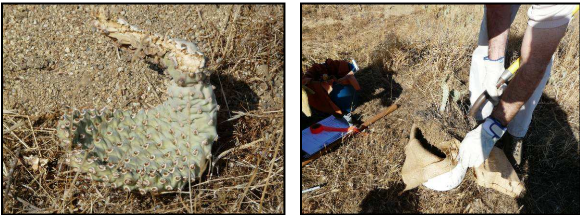
Figure 2. Shed pad from Bakersfield cactus and clump being collected at the Sand Ridge Preserve, Kern County, California.

We collected 25 cactus pads and 10 cactus clumps from the Sand Ridge Preserve on 19 October 2009. We collected pads that had been naturally shed from plants yet had not become rooted to the ground (Figure 2). Each pad had already formed a callus at the point where it detached from the plant, and therefore it was not necessary to allow the pads to “heal” before translocating them. Each collected pad was assigned a code (P1-P25), then weighed and measured (length and width). Also, some pads that exhibited signs of partial desiccation (i.e., yellowish or brownish coloration) were collected to determine the success of these pads relative to pads that were green with no signs of desiccation. Each pad was transported to the introduction site in a small paper bag that was labeled with the appropriate pad number. The pads that we collected ranged in weight from 3.0 to 93.0 g (mean = 25.1 g; standard deviation = 22.6 g).