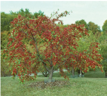
Figure 2: Malus 'David'