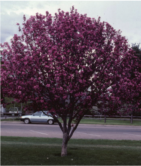
Figure 1: Malus 'Radiant'