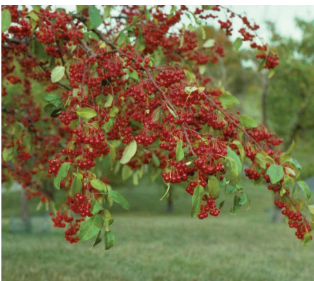
Figure 3: Malus 'David'

inches of annual moisture (precipitation plus any supplemental watering). Planting them in high-maintenance turfgrass generally subjects them to more water and fertilizer than they need, often resulting in more incidence of disease. A better location is in mulched beds,