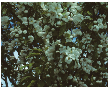
Figure 4: Malus 'Spring Snow'