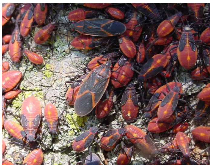
Boxelder bug adults and nymphs.

Once inside the home, boxelder bugs are difficult to control. Household sprays containing pyrethrins or resmethrin may give temporary control. A fly swatter and either a vacuum cleaner or broom and dust pan are often the best way to rid the home of these pests.