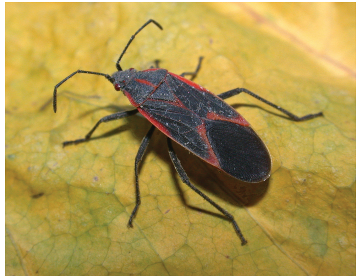
Boxelder bug.

Adult boxelder bugs are approximately 1/2 inch in length, dark brown to black in color with conspicuous red markings on their backs. The young (nymphs) are bright red and wingless but are generally similar in shape to the adults.