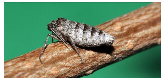
Adult male (top) and female (bottom) fall cankerworm.