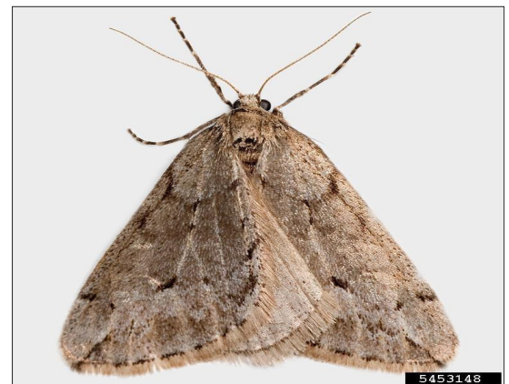
Adult male spring cankerworm.

The larvae (caterpillars) of both species occur together and have similar eating habits. They destroy the young leaves and buds of numerous species of deciduous trees, but prefer elm and apple trees. Trees may become totally defoliated, which may result in the trees' death. Death is more likely if the trees have been defoliated more than once or are not vigorous. Toward the end of the larvae's feeding period (late-May, early-June), the affected trees begin to take on a lacy appearance. Cankerworm larvae feed for about 3 to 4 weeks and then crawl down the trunk or drop by silk threads to the ground where they enter the soil to a depth of 1-4". In the soil, they transform into the pupal stage. Pupae remain in the soil until fall. Fall cankerworm moths begin to emerge from the soil soon after the first frost. The spring cankerworm remains in the pupal stage during winter and emerge as moths a few days after the snow has melted in spring.