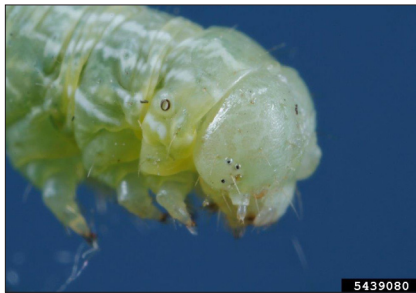
Spring cankerworm larva. Credits: USDA Forest Service - Northeastern Area, Bugwood.org (top) and James B. Hanson, USDA Forest Service, Bugwood.org (bottom).