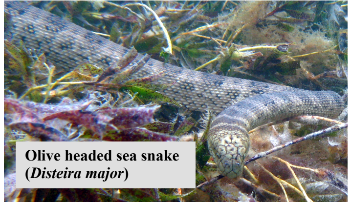
Olive headed sea snake ( Disteira major )