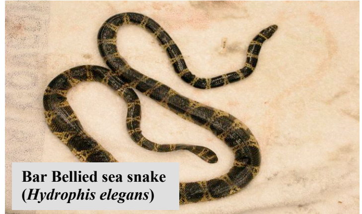
Bar Bellied sea snake ( Hydrophis elegans )