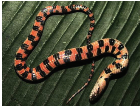
59 Helicops angulatus COLUBRIDAE Mountain Keelback JDV