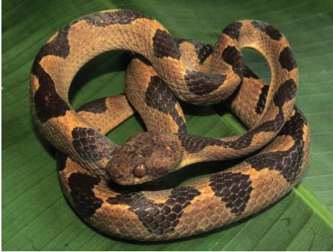
64 Leptodeira annulata COLUBRIDAE Banded Cat-eyed Snake JDV