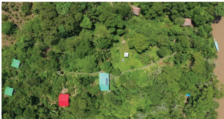
Kawsay Biological Station, Madre de Dios, Peru.