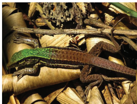
17 Ameiva ameiva TEIIDAE Giant Ameiva