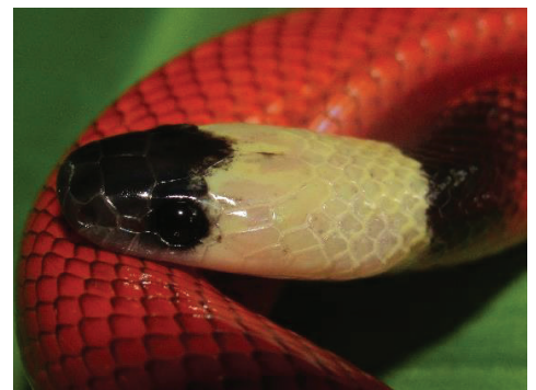
72 Pseudoboa coronata (Juvenile) COLUBRIDAE Crowned False Boa JDV