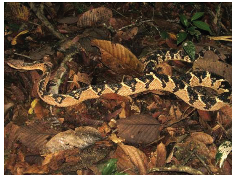
77 Lachesis muta VIPERIDAE South American Bushmaster JDV