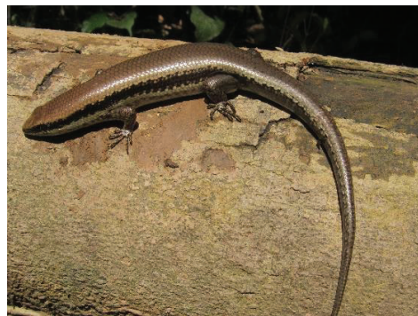
8 Varzea altamazonica SCINCIDAE JDV