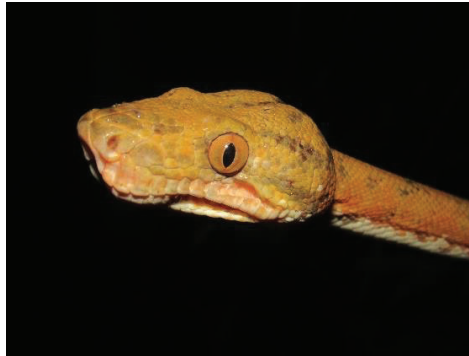
29 Corallus hortulanus BOIDAE Garden Tree Boa JDV