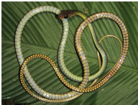
41 Chironius multiventris COLUBRIDAE South American Sipo JDV