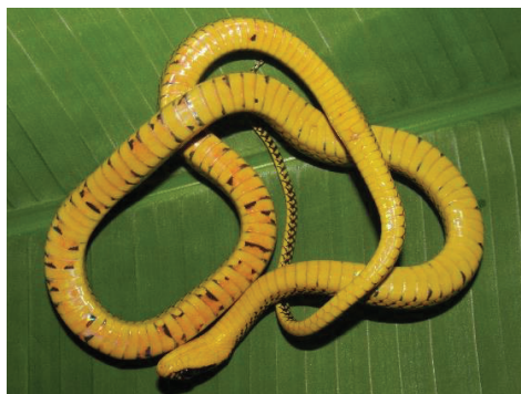
53 Erythrolamprus dorsocorallinus COLUBRIDAE JDV