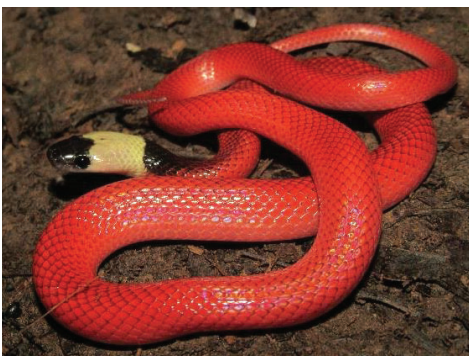
70 Pseudoboa coronata (Juvenile) COLUBRIDAE Crowned False Boa JDV