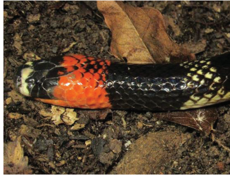
74 Micrurus lemniscatus ELAPIDAE South American Coral Snake JDV