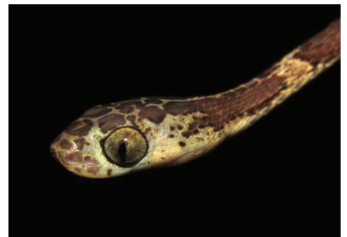
63 Imantodes cenchoa COLUBRIDAE JDV