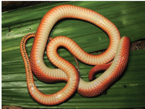
68 Oxyrhopus melanogenys COLUBRIDAE Tschudi's False Coral Snake JDV