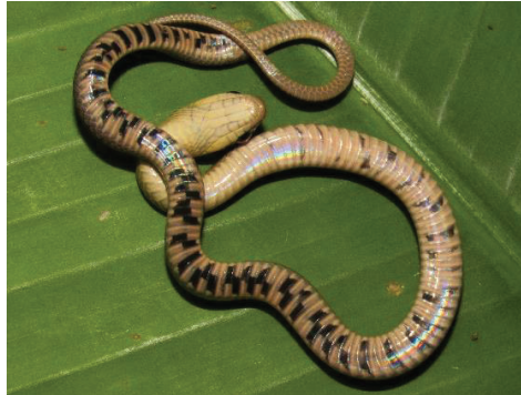
56 Erythrolamprus reginae (Juvenile) COLUBRIDAE Royal Ground Snake JDV