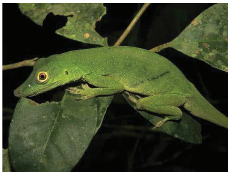
7 Anolis punctatus (Female) DACTYLOIDAE Spotted Anole JDV