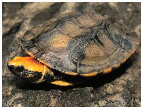
80 Platemys platycephala CHELIDAE JDV