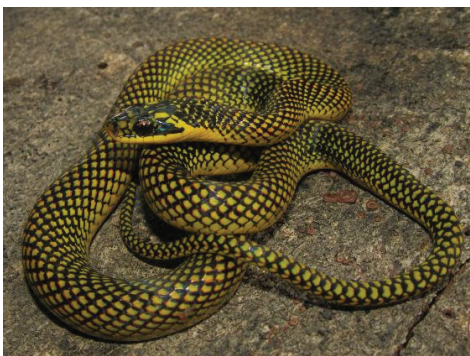
52 Erythrolamprus dorsocorallinus COLUBRIDAE JDV