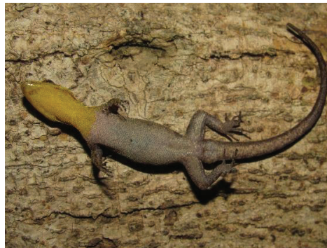
14 Gonatodes humeralis (Male) SPHAERODACTYLIDAE JDV