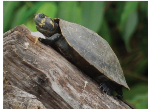
84 Podocnemis unifilis PELOMEDUSIDAE Yellow-spotted River Turtle