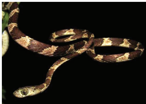
62 Imantodes cenchoa COLUBRIDAE JDV