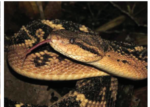
78 Lachesis muta VIPERIDAE South American Bushmaster JDV