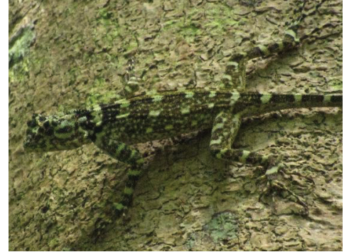
21 Plica plica TROPIDURIDAE Tree Runner JDV