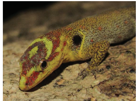
15 Gonatodes humeralis (Male) SPHAERODACTYLIDAE JDV