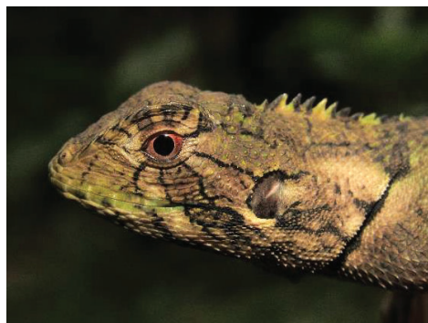
26 Plica umbra TROPIDURIDAE Blue-Lipped Tree Lizard JDV