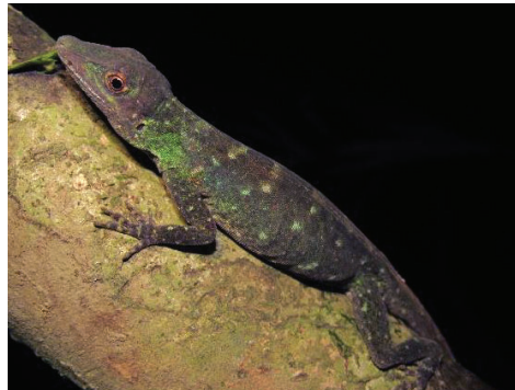
5 Anolis punctatus (Female) DACTYLOIDAE Spotted Anole JDV