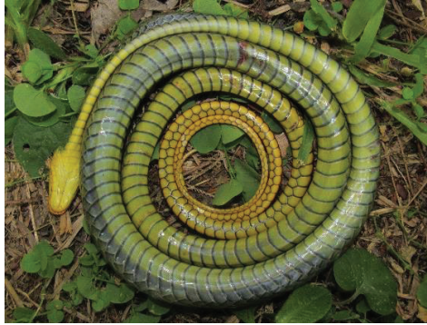
38 Chironius exoletus COLUBRIDAE Linnaeus' Sipo JDV