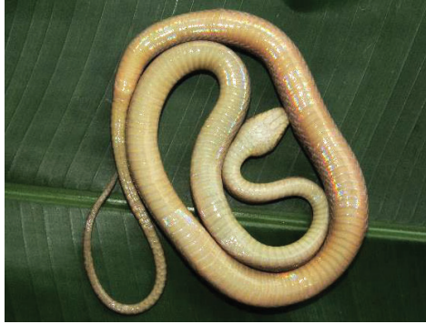
65 Leptodeira annulata COLUBRIDAE Banded Cat-eyed Snake JDV