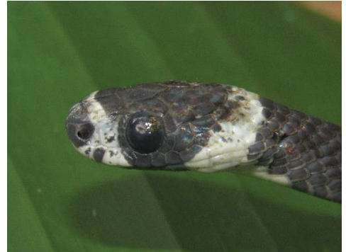
48 Dipsas catesbyi COLUBRIDAE Catesby's Snail-eater JDV