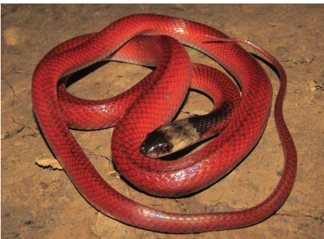
43 Clelia clelia (Juvenile) COLUBRIDAE Mussurana JDV