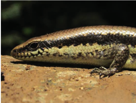
10 Varzea altamazonica SCINCIDAE JDV