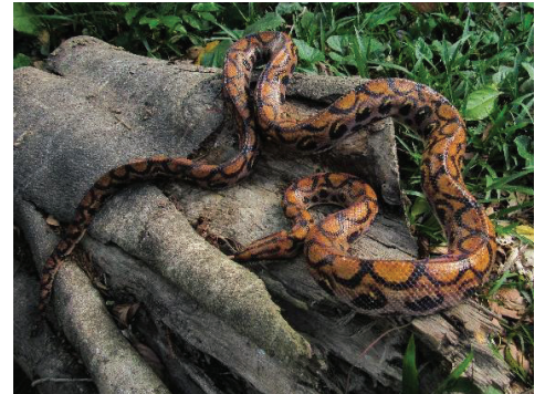
30 Epicrates cenchria BOIDAE Rainbow Boa JDV