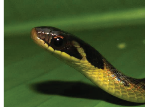
57 Erythrolamprus reginae (Juvenile) COLUBRIDAE Royal Ground Snake JDV