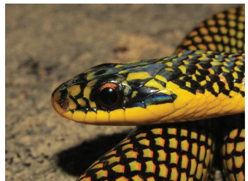
54 Erythrolamprus dorsocorallinus COLUBRIDAE JDV