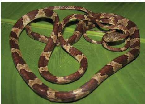
61 Imantodes cenchoa COLUBRIDAE JDV