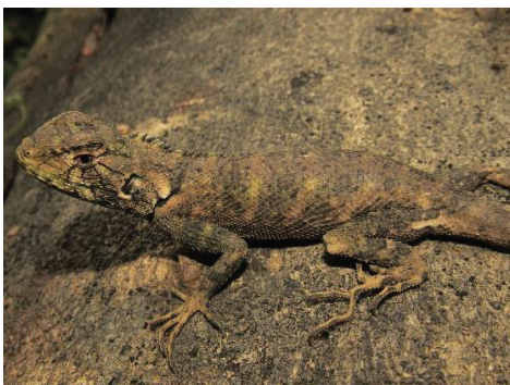
25 Plica umbra TROPIDURIDAE Blue-Lipped Tree Lizard JDV