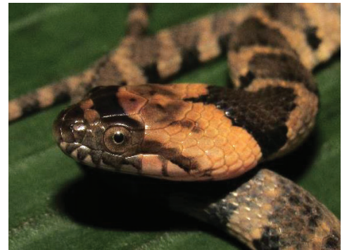
60 Helicops angulatus COLUBRIDAE Mountain Keelback JDV