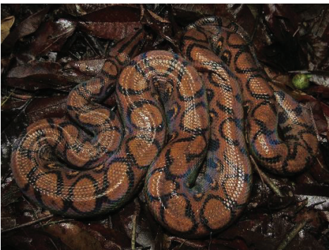
31 Epicrates cenchria BOIDAE Rainbow Boa JDV