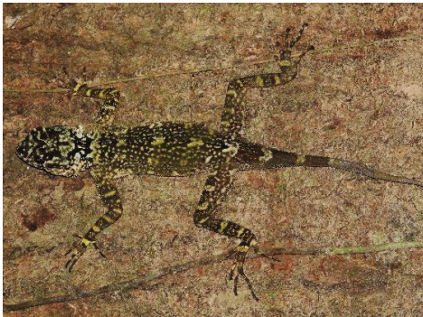
22 Plica plica TROPIDURIDAE Tree Runner JDV