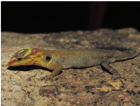
13 Gonatodes humeralis (Male) SPHAERODACTYLIDAE JDV