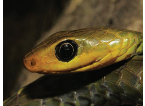
39 Chironius exoletus COLUBRIDAE Linnaeus' Sipo JDV