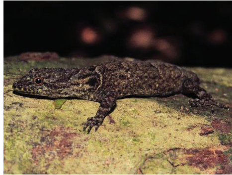
11 Gonatodes humeralis (Female) SPHAERODACTYLIDAE JDV