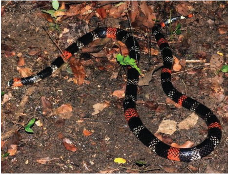
73 Micrurus lemniscatus ELAPIDAE South American Coral Snake LB