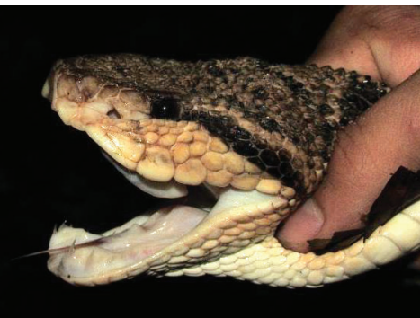
79 Lachesis muta VIPERIDAE South American Bushmaster JDV