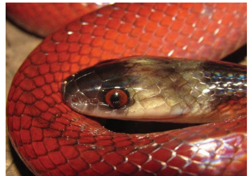
45 Clelia clelia (Juvenile) COLUBRIDAE Mussurana JDV