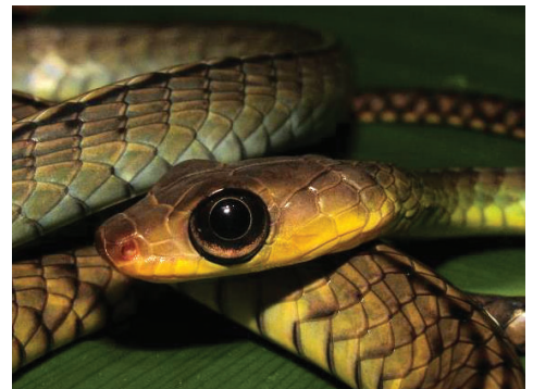
42 Chironius multiventris COLUBRIDAE South American Sipo JDV