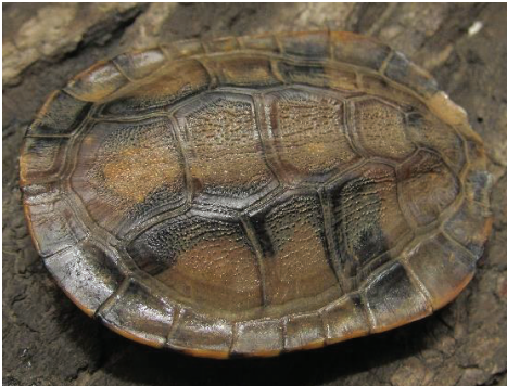
82 Platemys platycephala CHELIDAE