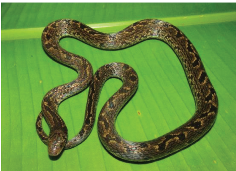
34 Atractus major COLUBRIDAE Brown Ground Snake JDV