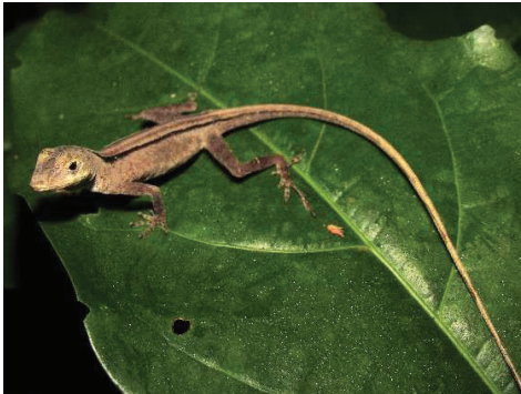
1 Anolis fuscoauratus (Female) DACTYLOIDAE Brown-eared Anole JDV