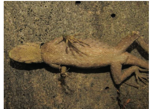
24 Plica umbra TROPIDURIDAE Blue-Lipped Tree Lizard JDV