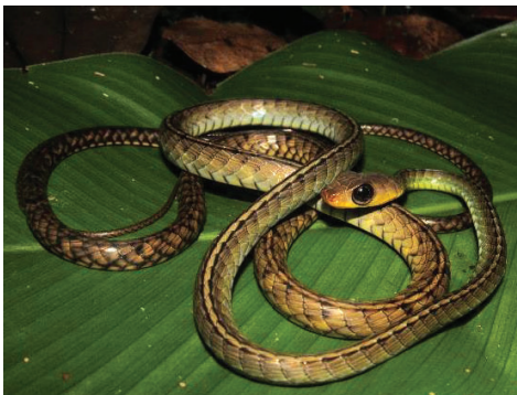
40 Chironius multiventris COLUBRIDAE South American Sipo JDV