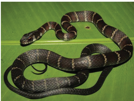
49 Drymoluber dichrous (Juvenile) COLUBRIDAE Northern Woodland Racer JDV