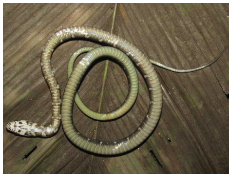
50 Drymoluber dichrous (Juvenile) COLUBRIDAE Northern Woodland Racer JDV