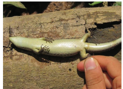
9 Varzea altamazonica SCINCIDAE JDV