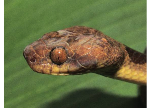
66 Leptodeira annulata COLUBRIDAE Banded Cat-eyed Snake JDV