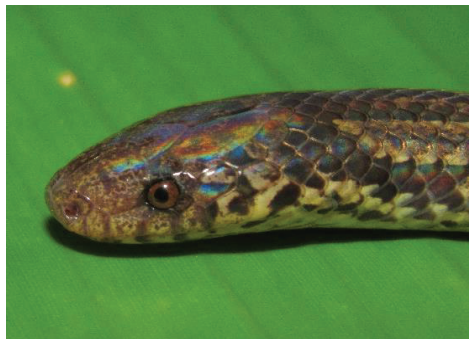
35 Atractus major COLUBRIDAE Brown Ground Snake JDV