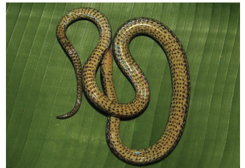
36 Atractus major COLUBRIDAE Brown Ground Snake JDV