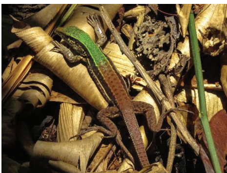
16 Ameiva ameiva TEIIDAE Giant Ameiva