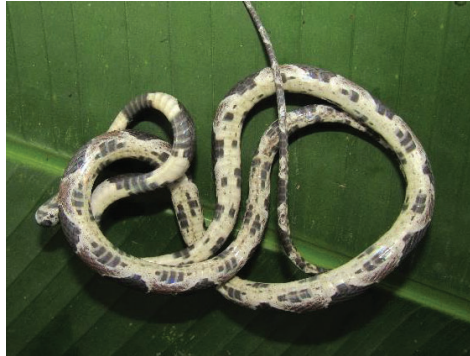
47 Dipsas catesbyi COLUBRIDAE Catesby's Snail-eater JDV