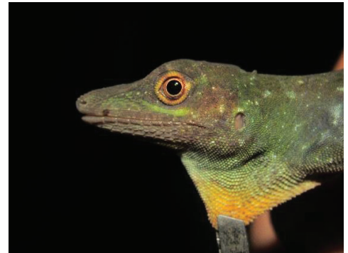
6 Anolis punctatus (Female) DACTYLOIDAE Spotted Anole JDV