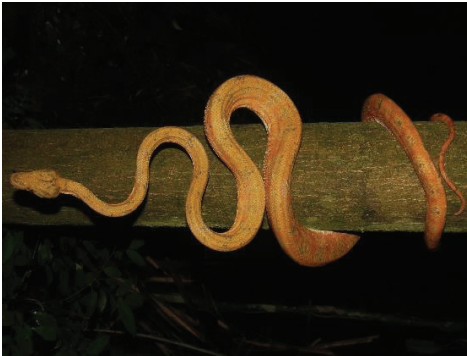
28 Corallus hortulanus BOIDAE Garden Tree Boa JDV