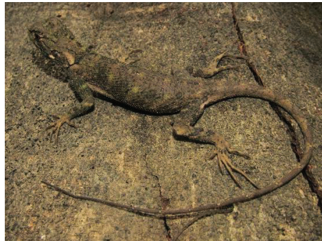
23 Plica umbra TROPIDURIDAE Blue-Lipped Tree Lizard JDV