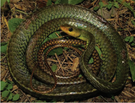
37 Chironius exoletus COLUBRIDAE Linnaeus' Sipo JDV