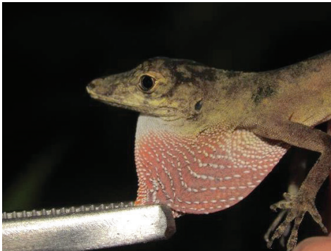
4 Anolis fuscoauratus (Male) DACTYLOIDAE Brown-eared Anole JDV