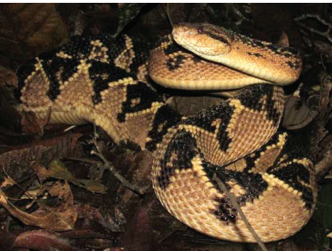
76 Lachesis muta VIPERIDAE South American Bushmaster JDV