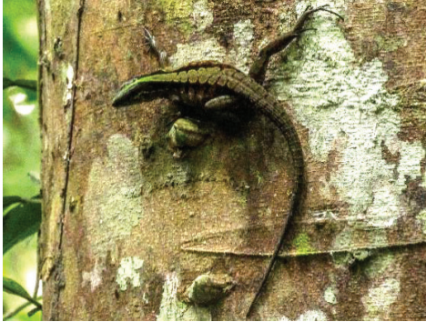
19 Kentropyx pelviceps TEIIDAE Forest Whiptail JDV