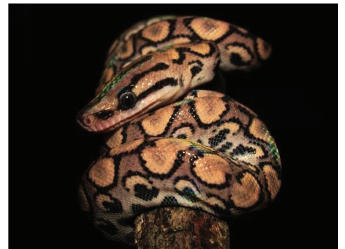
33 Epicrates cenchria (Juvenil) BOIDAE Rainbow Boa JDV