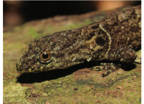
12 Gonatodes humeralis (Female) SPHAERODACTYLIDAE JDV