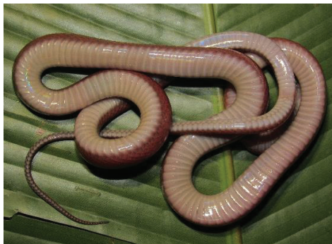
44 Clelia clelia (Juvenile) COLUBRIDAE Mussurana JDV