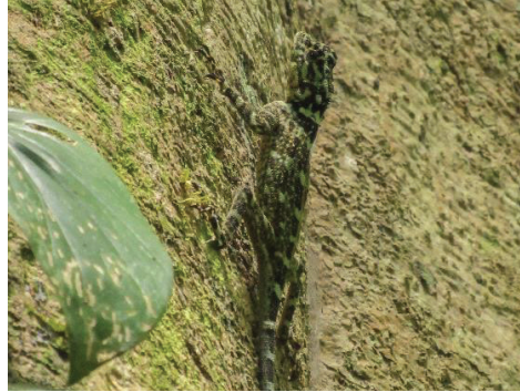
20 Plica plica TROPIDURIDAE Tree Runner JDV