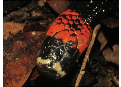
75 Micrurus lemniscatus ELAPIDAE South American Coral Snake JDV