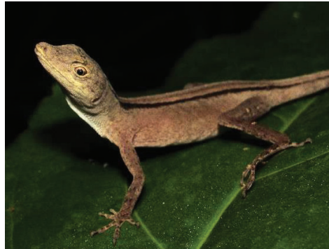
2 Anolis fuscoauratus (Female) DACTYLOIDAE Brown-eared Anole JDV