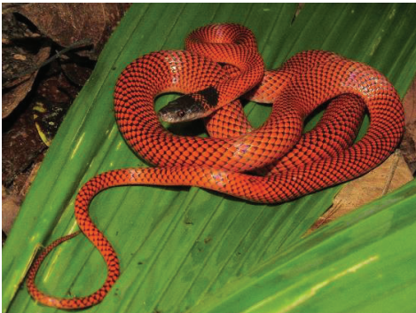
67 Oxyrhopus melanogenys COLUBRIDAE Tschudi's False Coral Snake JDV