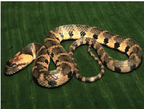
58 Helicops angulatus COLUBRIDAE Mountain Keelback JDV