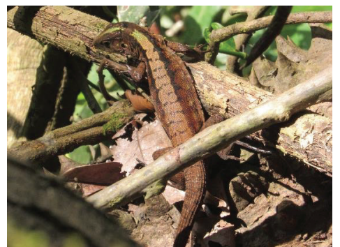
18 Kentropyx pelviceps TEIIDAE Forest Whiptail JDV