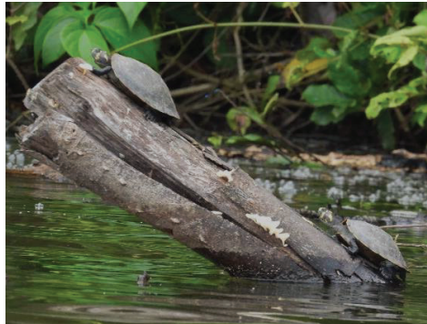
83 Podocnemis unifilis PELOMEDUSIDAE Yellow-spotted River Turtle