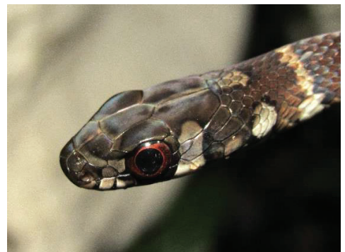
51 Drymoluber dichrous (Juvenile) COLUBRIDAE Northern Woodland Racer JDV