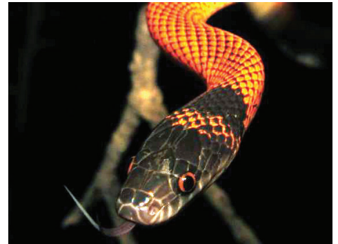
69 Oxyrhopus melanogenys COLUBRIDAE Tschudi's False Coral Snake JDV