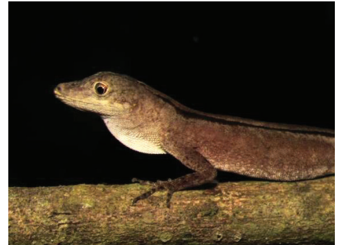
3 Anolis fuscoauratus (Female) DACTYLOIDAE Brown-eared Anole JDV