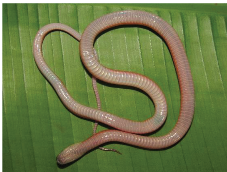
71 Pseudoboa coronata (Juvenile) COLUBRIDAE Crowned False Boa JDV