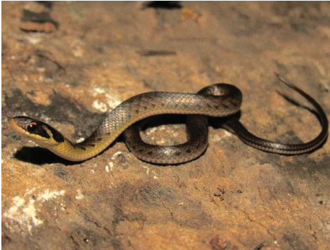
55 Erythrolamprus reginae (Juvenile) COLUBRIDAE Royal Ground Snake JDV