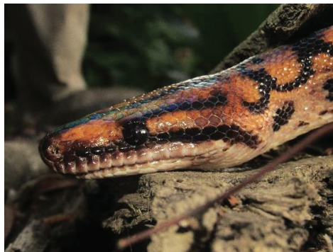
32 Epicrates cenchria BOIDAE Rainbow Boa JDV