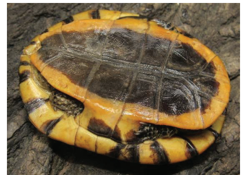
81 Platemys platycephala CHELIDAE JDV