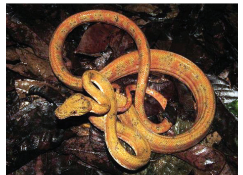
27 Corallus hortulanus BOIDAE Garden Tree Boa JDV