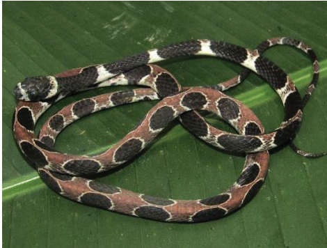
46 Dipsas catesbyi COLUBRIDAE Catesby's Snail-eater JDV