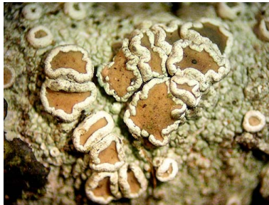
5 Lecanora arthothelinella