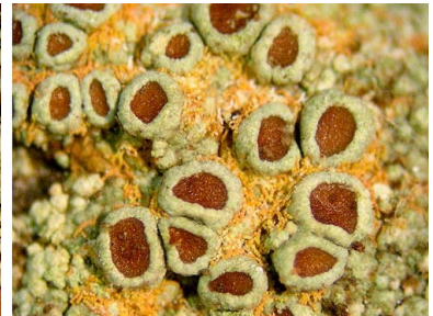
8 Lecanora austrotropica