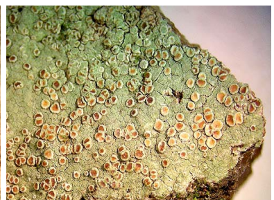
20 Lecanora subimmersens