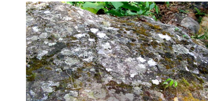
37 Lichen community on rocks