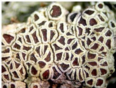
9 Lecanora austrotropica