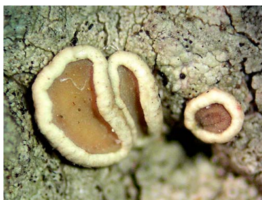
17 Lecanora lividocarnea