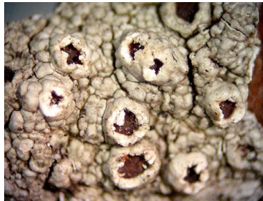
35 Loxospora lecanoriformis SARRAMEANACEAE