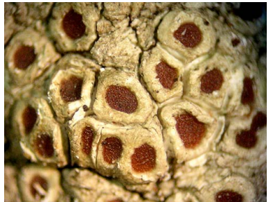
36 Loxospora lecanoriformis SARRAMEANACEAE