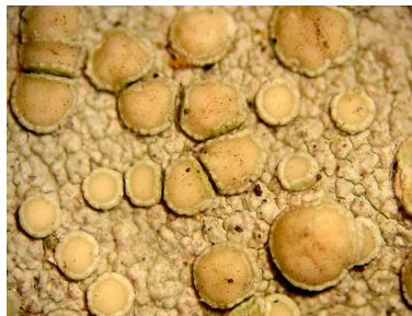
14 Lecanora helva