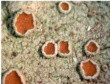
25 Lecanora tropica