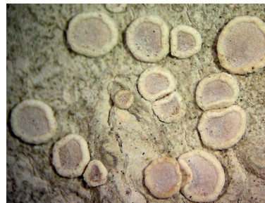
11 Lecanora caesiorubella