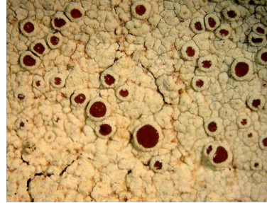
3 Lecanora argentata