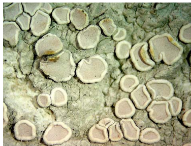
10 Lecanora caesiorubella