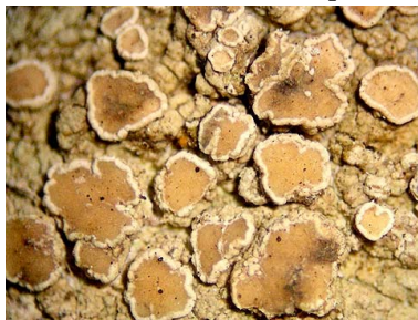
13 Lecanora helva