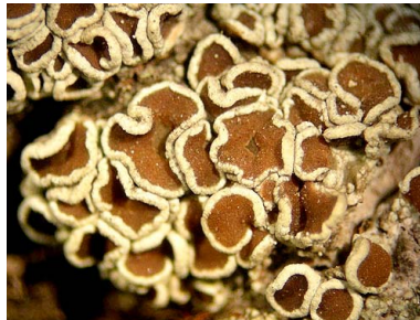
27 Lecanora ulrikii