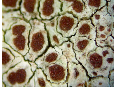
23 Lecanora subimmersa