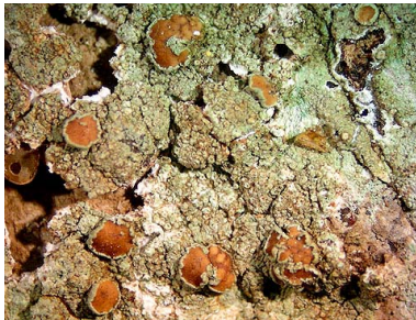
29 Lecanora sp. C