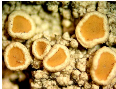
6 Lecanora arthothelinella