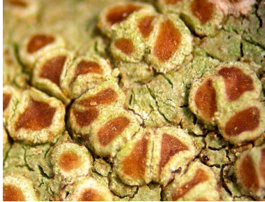
21 Lecanora subimmergens