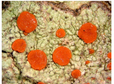
32 Ramboldia russula