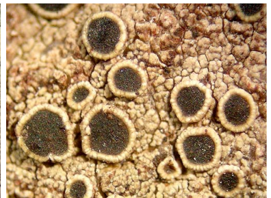
12 Lecanora flavoviridis