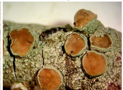
16 Lecanora lividocarnea