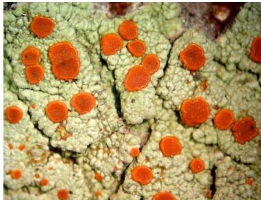
30 Ramboldia russula