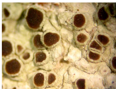
18 Lecanora phaeocardia