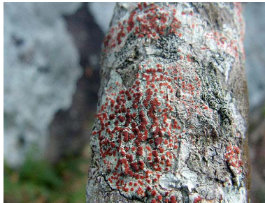
34 Ramboldia russula