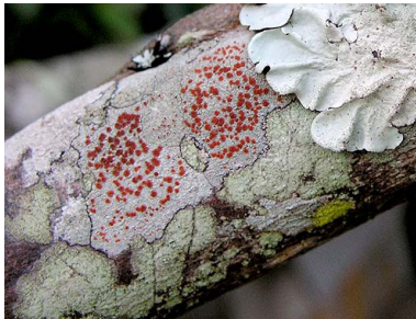
33 Ramboldia russula