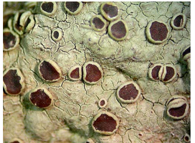
28 Lecanora sp. B