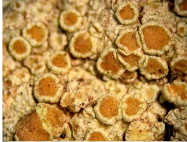
1 Lecanora achroa

Rapid Color Guide #252 version 1 06/2009