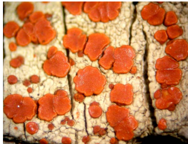
31 Ramboldia russula