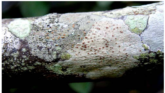
38 Two Lecanora spp. on a tree branch