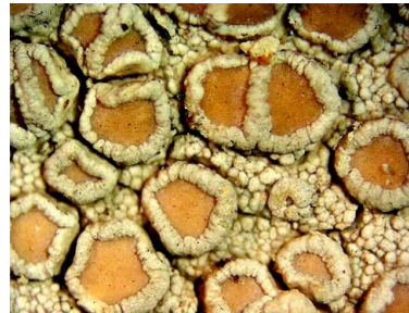
7 Lecanora cf. arthothelinella