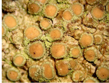
2 Lecanora achroa