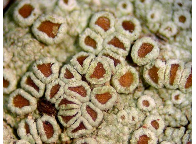
24 Lecanora tropica