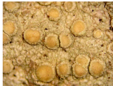
15 Lecanora leprosa