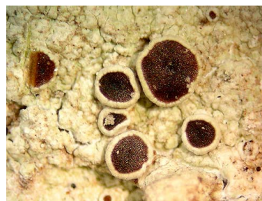
19 Lecanora phaeocardia