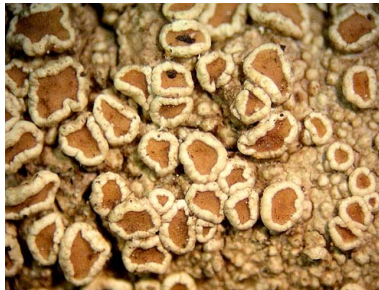
26 Lecanora ulrikii