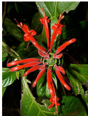
17 Pachystachys puberula