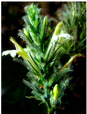
26 Schaueria capitata