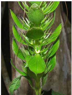
6 Pachystachys killipii