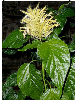
23 Schaueria calytricha Syn.: Schaueria calycotricha