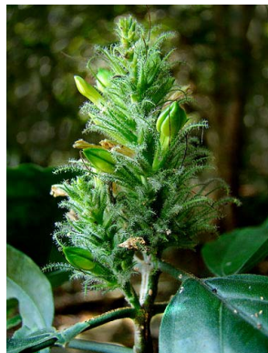
27 Schaueria capitata