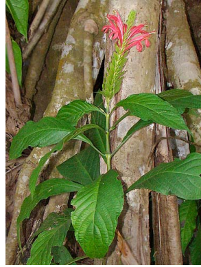
3 Pachystachys killipii