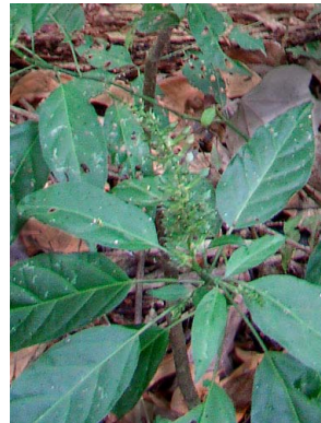
34 Schaueria litoralis Syn.: Schaueria lophura