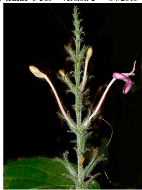
45 Streblacanthus dubiosus