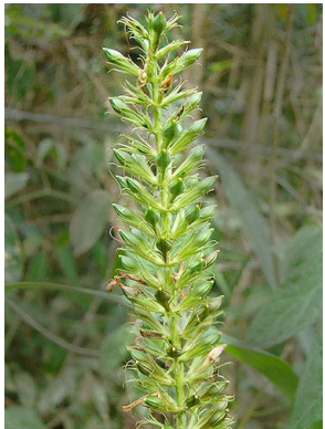
36 Schaueria litoralis Syn.: Schaueria lophura