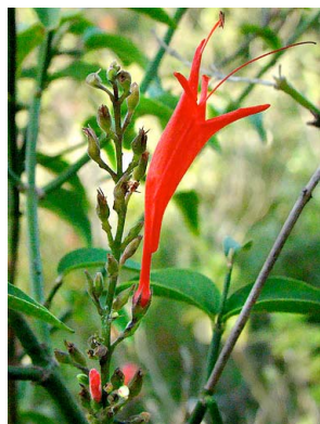
54 Thysacanthus ramosissimus