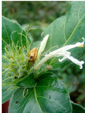
33 Schaueria lachynostachya