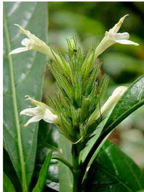
38 Schaueria marginata