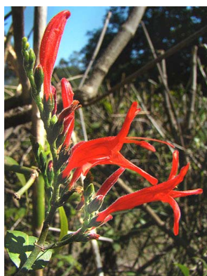
48 Thysacanthus boliviensis