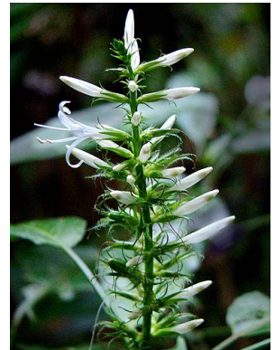
35 Schaueria litoralis Syn.: Schaueria lophura