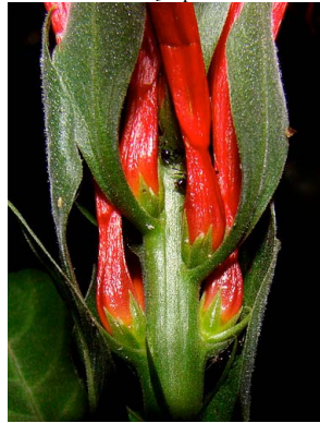
22 Pachystachys spicata