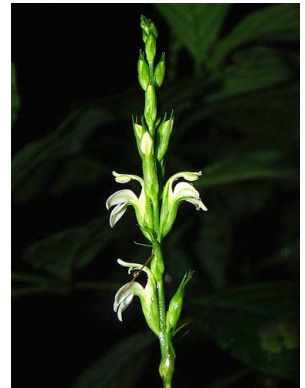
40 Schaueria paranaensis Syn.: Justicia paranaensis