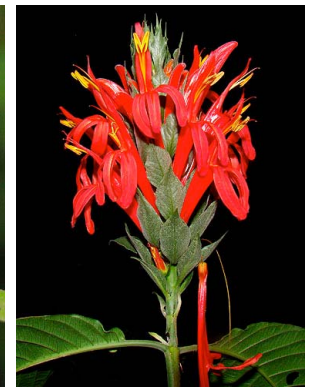
20 Pachystachys spicata