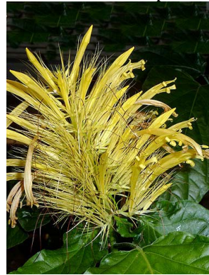
24 Schaueria calytricha Syn.: Schaueria calycotricha