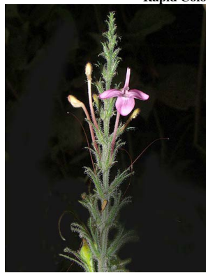
44 Streblacanthus dubiosus