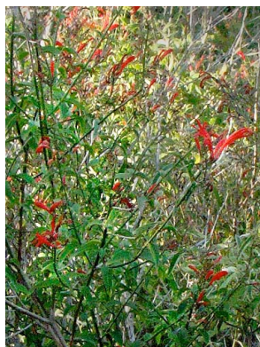
53 Thysacanthus ramosissimus