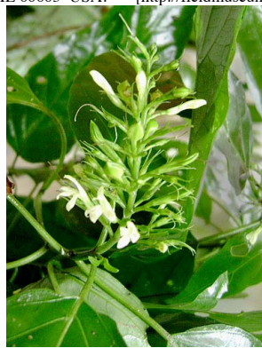
42 Schaueria thyrsoiflora [sp. nov. ined.]