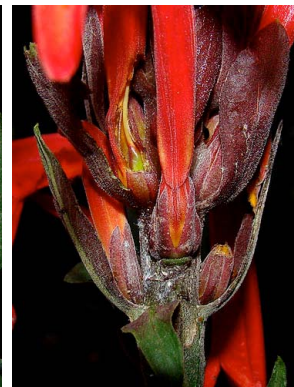
14 Pachystachys ossolae