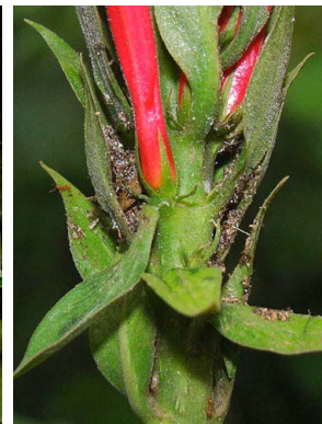
19 Pachystachys rosea