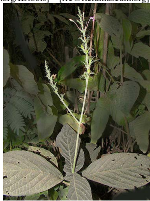
43 Streblacanthus dubiosus