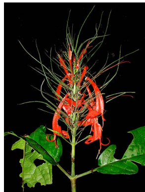
8 Pachystachys linearibracteata [sp. nov. ined.]