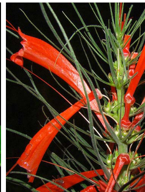
9 Pachystachys linearibracteata [sp. nov. ined.]