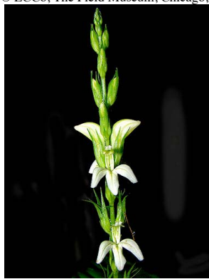
41 Schaueria paranaensis Syn.: Justicia paranaensis