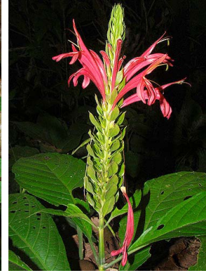
4 Pachystachys killipii