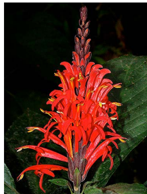
13 Pachystachys ossolae