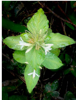
32 Schaueria lachynostachya