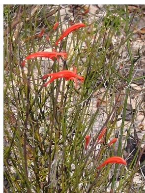
49 Thysacanthus microphyllus