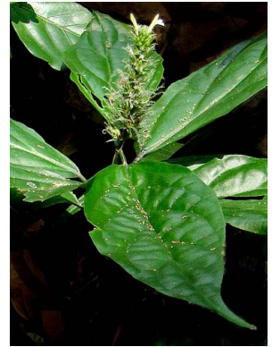
25 Schaueria capitata