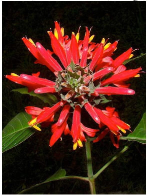
21 Pachystachys spicata