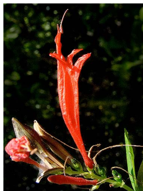
55 Thysacanthus secundus