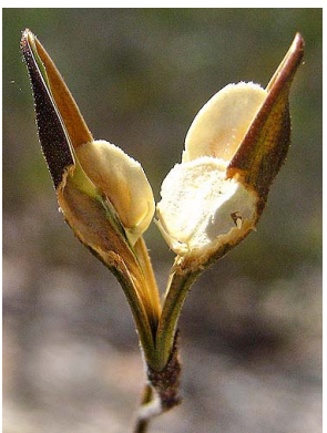
52 Thysacanthus microphyllus