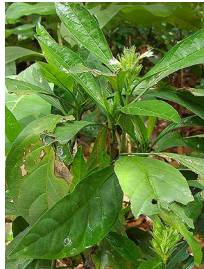
37 Schaueria marginata