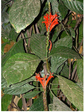
1 Pachystachys badiospica