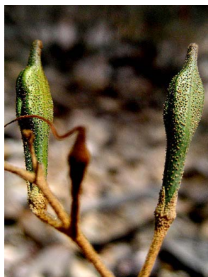
51 Thysacanthus microphyllus