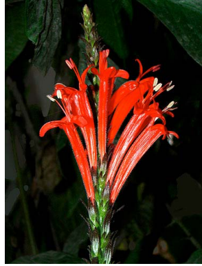
2 Pachystachys badiospica