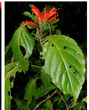
15 Pachystachys puberula