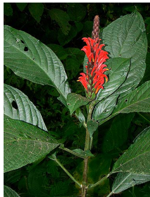
12 Pachystachys ossolae