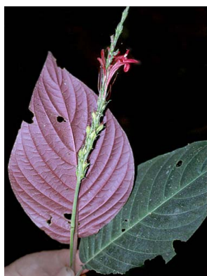
46 Streblacanthus roseus