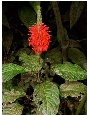
18 Pachystachys rosea