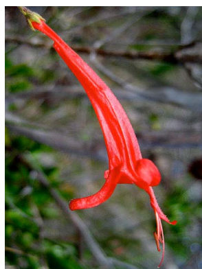
50 Thysacanthus microphyllus