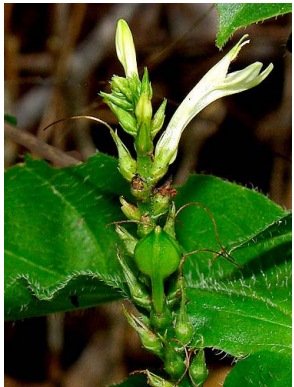
31 Schaueria hirta [sp. nov. ined.]