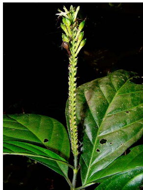
28 Schaueria gonystachya