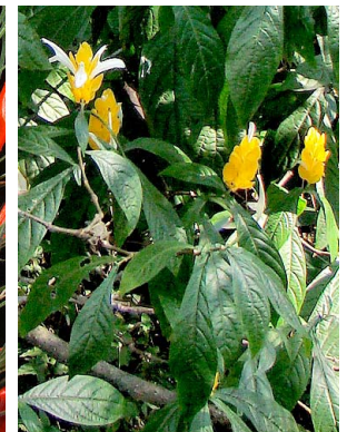
10 Pachystachys lutea