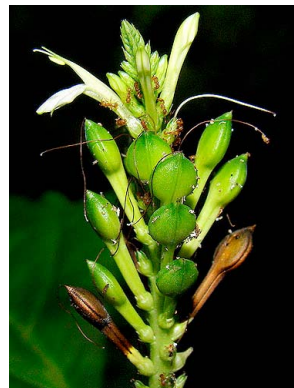
29 Schaueria gonystachya