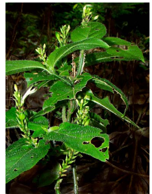
30 Schaueria hirta [sp. nov. ined.]