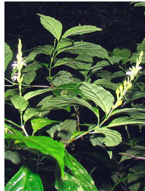
39 Schaueria paranaensis Syn.: Justicia paranaensis