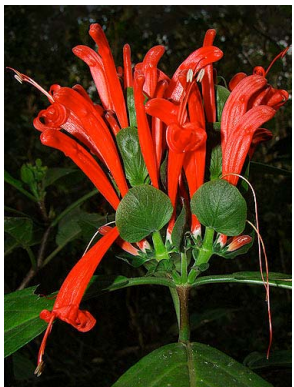
16 Pachystachys puberula