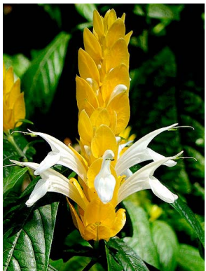
11 Pachystachys lutea