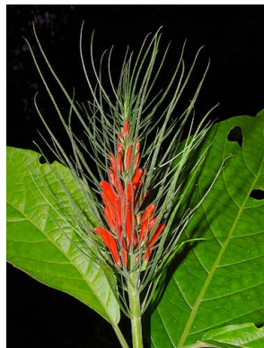
7 Pachystachys linearibracteata [sp. nov. ined.]