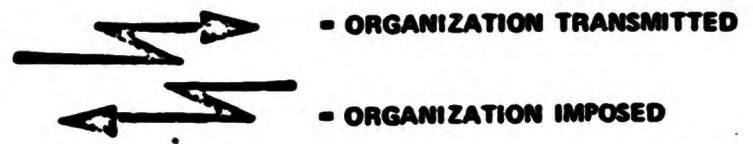
AN INFORMATION PROCESSING MODEL OF THE SYSTEMS INFLUENCING READING COMPREHENSION