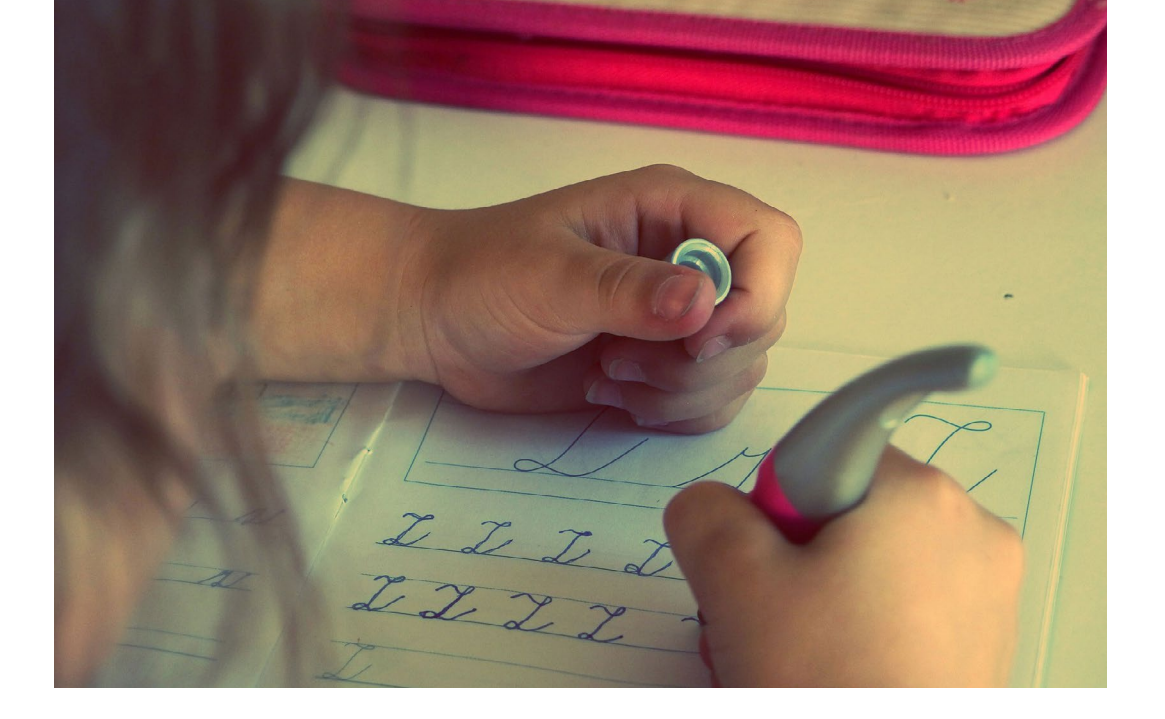
to lead it. School turnarounds do not happen on their own — laser-focused, empowered transformation leaders drive such change.

• The Right Staff. Without exception, every member of the school staff must be committed to the dramatic change planned for the school and each must be ready to embrace both schoolwide and individual changes demanded by the school leader. This almost always requires the replacement of select staff, and thus rarely can be effectively and quickly accomplished within the confines of typical teacher and school staff collective bargaining contracts. In failing schools targeted for successful turnaround, the avoidance of existing contracts must be allowed, and the turnaround leader should be given the ability to rehire (or not) current staff, renegotiate a new contract, and establish a turnaround version of the school without being bound by the local teacher and staff contract.<sup>109</sup>