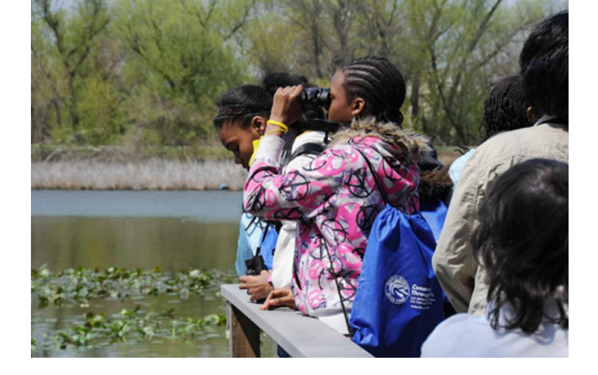
Level 3 in English Language Arts, and a Level 1 in math, the lowest possible level.<sup>59</sup> Overall, ASD scored a Level 1, the lowest rank, in growth of student academic scores.

Comprehensive and more detailed comparative analysis of recent performance of ASD schools is significantly hindered because the Tennessee Comprehensive Achievement Program exams were not scored for the 2015-16 school year due to a glitch in the transition to an online test format; the 2016-17 ELA exam is available only for nine out of 23 ASD schools because of another online glitch; and the state changed its test score reporting methods in school year 2017-18. In general, however, ASD schools have showed minimal year-to-year gains; while that compares favorably to slippage in the average state year-to-year scores, ASD schools overall still significantly underperform the state average.