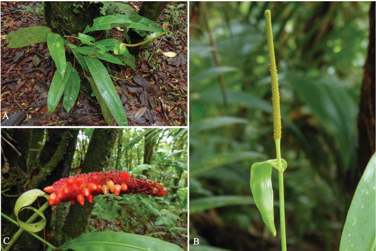
FIGURE 5. Anthurium chucantiense at the type locality. A. In its habitat. B. Flowering spadix. C. Infructescence spadix.

narrowly long-acuminate at apex, attenuate at base, medium-dark green and semiglossy above, moderately paler and matte below, drying dark brown above, moderately paler and yellow-brown below; midrib prominently raised, narrowly rounded and slightly paler above, V-shaped and paler below, drying concolorous above, reddish-brown below; primary lateral veins up to 15 pairs, arising at 55–75° angle, obscure and weakly etched above, weakly raised below, concolorous on both surfaces, drying weakly raised and slightly darker below; collective veins arising from one of the lowermost primary lateral veins. Inflorescence erect; peduncle terete, 26.5–54 cm long, 2.0 mm diam.; spathe green, medium green, decurrent into peduncle 0.2–2.0 cm, linear-lanceolate, 3.0–8.0 × 1.0–1.9 cm, spreading-reflexed and recurled, abruptly acuminate at apex; spadix erect, cylindrical, 5.7–12.5 cm long, 2.0–4.0 mm in diam., yellowish green and matte when stamens begin to emerge, becoming pale orange lower down, stipitate; stipe green, 2–19 mm long, 1–2 mm in diam. when dried; flowers 4 visible in the principal spiral, 3–6 in the alternate spiral; stamens slightly exerted, filaments translucent; anthers yellowish. Infructescence pendent, spathe green with reddish margins, spadix 8.5 cm long, 1.3 cm diam., ca. 6.5 times longer than wide, tepals brick-red; berries narrowly ovoid, orange-red, ca. 1 cm long when fresh, 0.7–0.9 cm long when dried, bluntly pointed at apex; seeds 2.