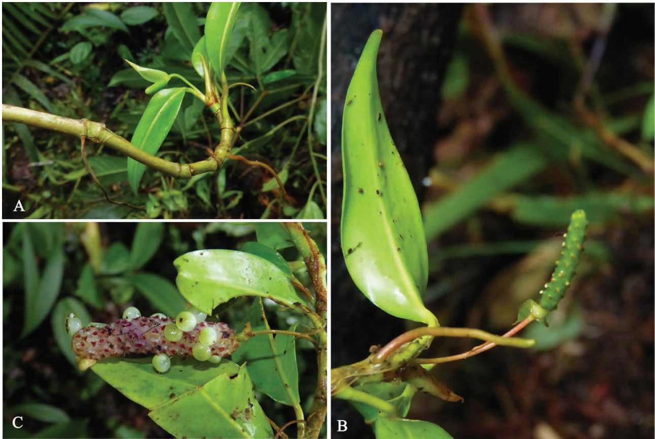
FIGURE 3. Anthurium annularum at the type locality. A. In its habitat. B. Flowering spadix. C. Infructescence spadix.