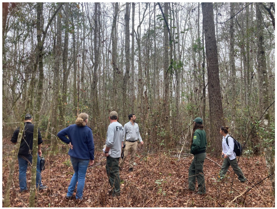
Narrow band of Bottomland Hardwood Forest