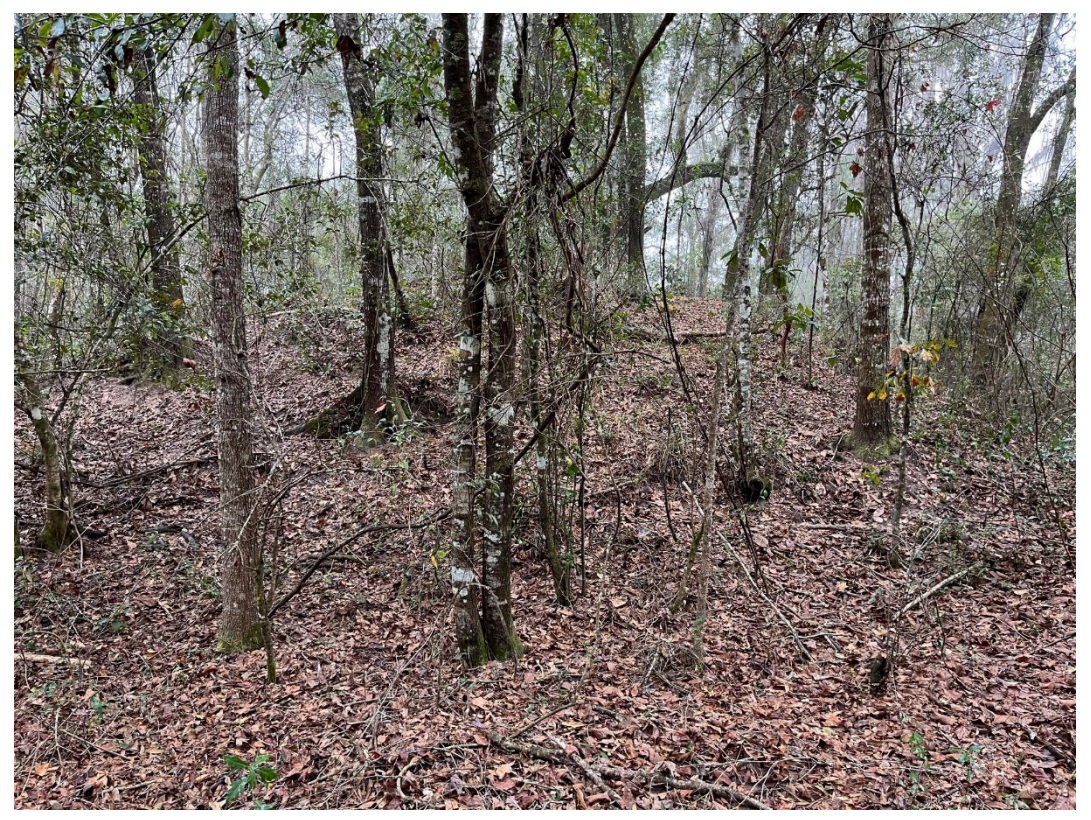
Native American Platform Mound within successional hardwood forest