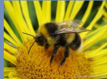
Suckley Cuckoo Bumble Bee