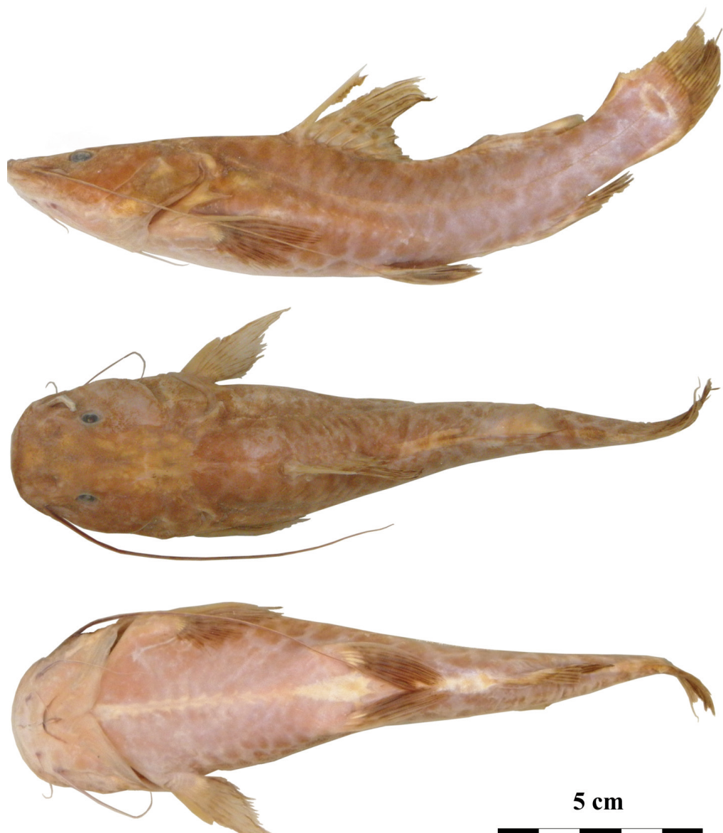
Figure 1 - Zungaro jahu in lateral, dorsal and ventral views: MHNM 1503, 168,3 mm SL, La Plata River near Limetas Stream, Conchillas, Colonia, Uruguay.