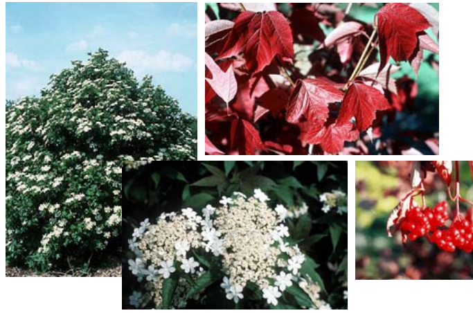
American Cranberrybush V. (Highbush Cranberry)