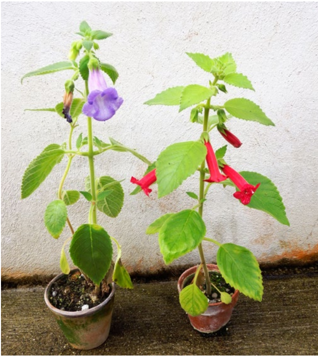
Fig. 3. – Image featuring the similar erect habit of Sinningia ganevii (left) and S. harleyi (right) and their distinct floral morphology corresponding to bee and hummingbird pollination syndrome, respectively.