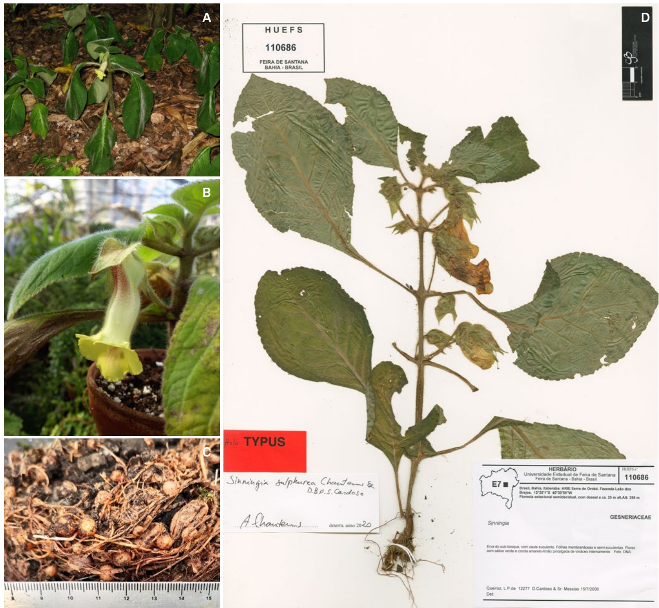
Fig. 4. – Sinningia sulphurea Chautems & D.B.O.S. Cardoso. A. Habit in the wild; B. Flower close-up; C. Underground storage system with numerous round tubers; D. Holotype at HUEFS. [A: Cardoso et al. 2066; B: cultivated in CJBG]