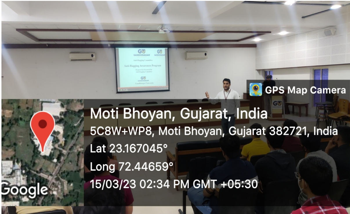
Newly admitted Students in Awareness Session