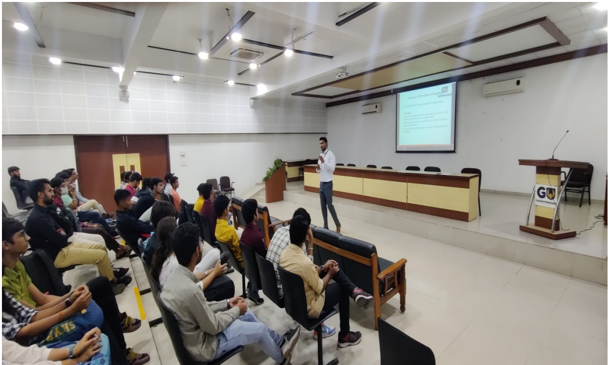
Students in Awareness Session of ARC