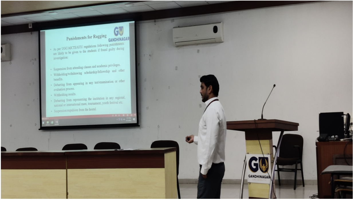
Speaker Explaining about various punishments if found guilty in Ragging