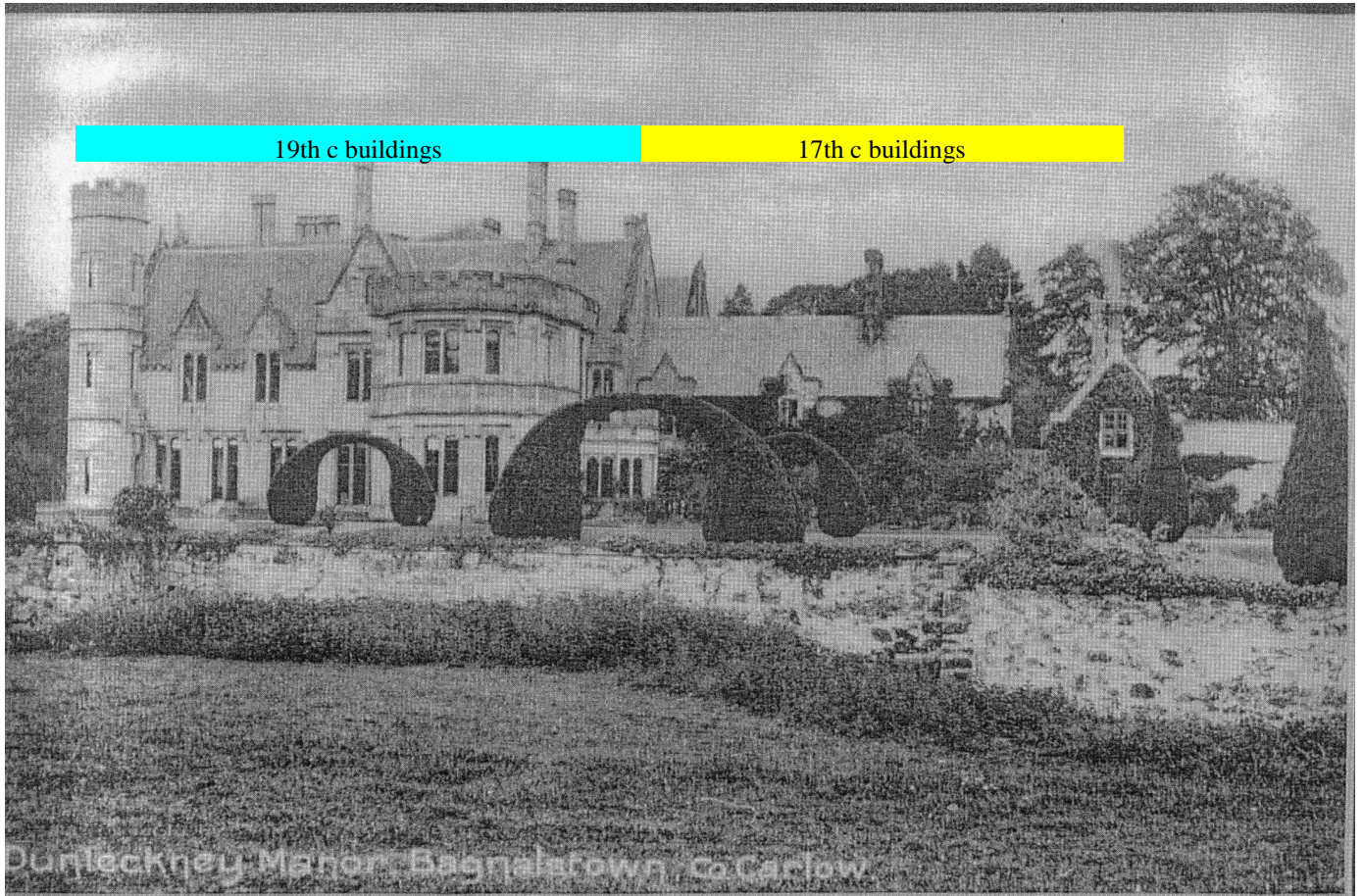
Late 19th c photographs. Laurence Collection. Courtesy of the National Library.