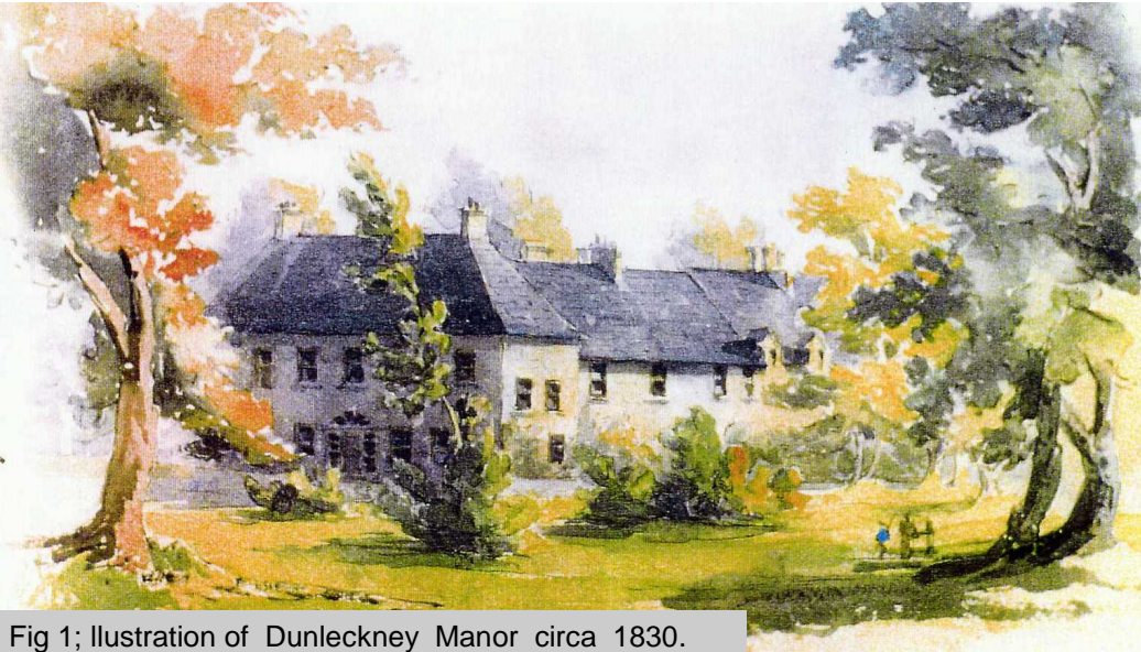
Fig 1; Illustration of Dunleckney Manor circa 1830. Courtesy of John Bagenal, Herts, England

In 1845 the Georgian style building was demolished completely and replaced with the present manor, designed in the Tudor Revival style by Robertson. Construction work by William Morrison of Station Road, Bagenalstown. Granite stone used in its construction was quarried at Boherduff nearby. The intricate carved stonework at the front of the building came from a deposit of very fine granite found at Kilcarrig Rocks. Bangor blue slate for the roof was installed by a team of slaters from Wales.