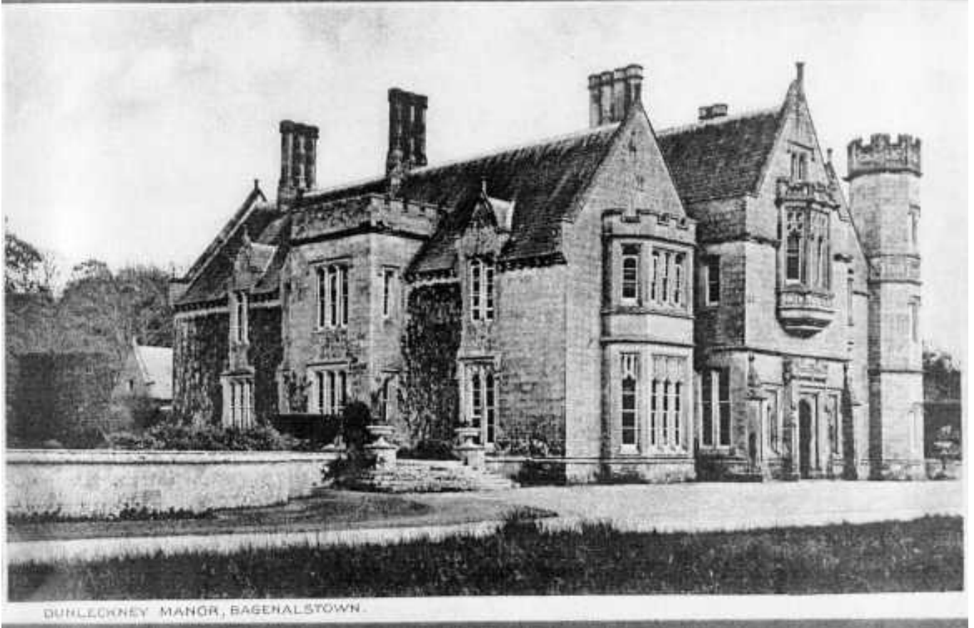
View from North-west