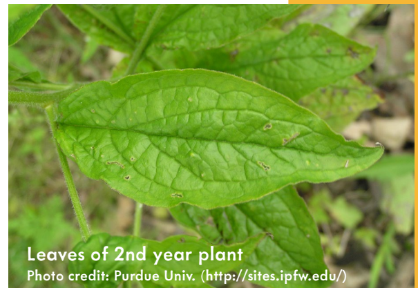
Leaves of 2nd year plant