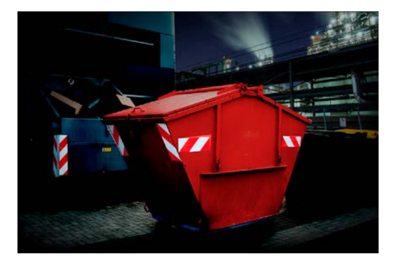
Avery Dennison Chevron White/Red used for container hazard marking.