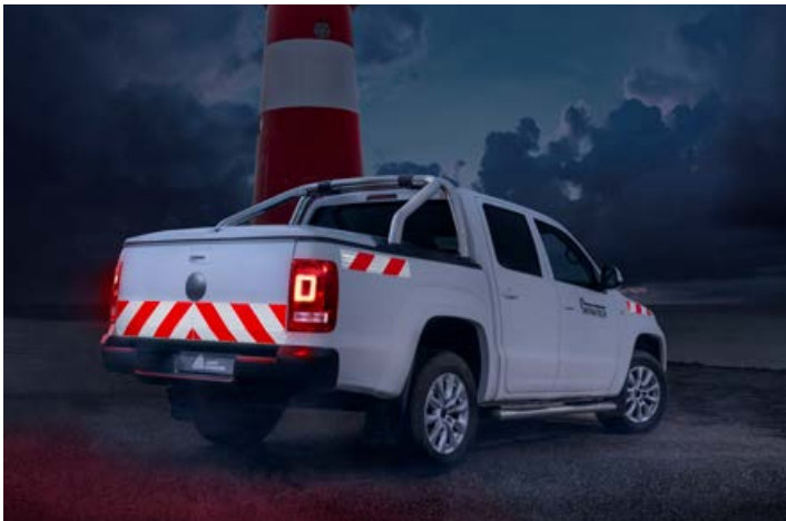
Avery Dennison Chevron White/Red used for vehicle marking according to DIN30710 and TPESC-B.