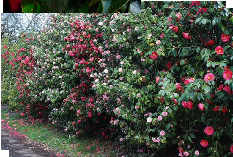
Grow a hedge of Camellias and add winter interest to your garden in shady areas.