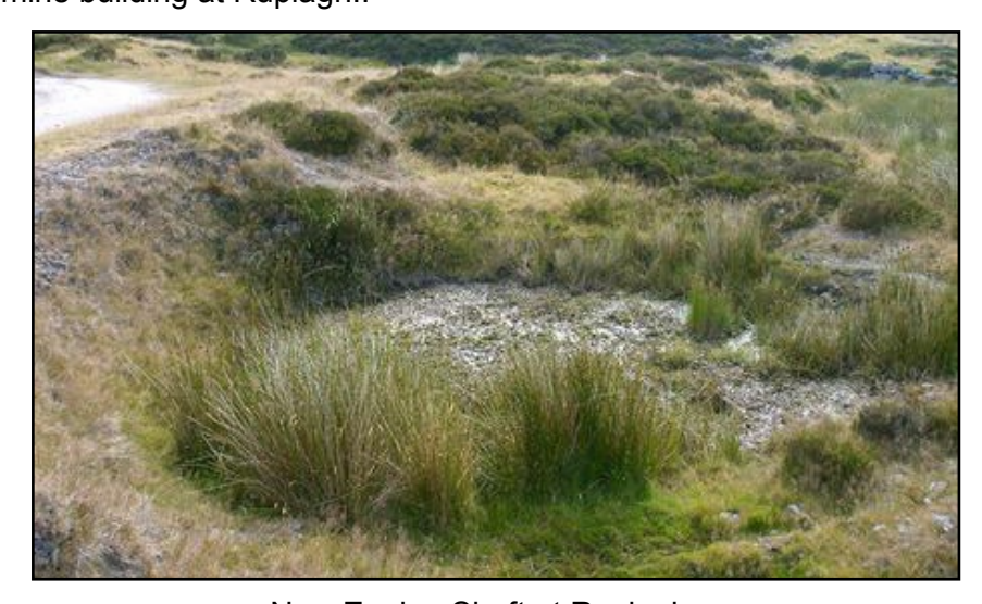
New Engine Shaft at Ruplagh.