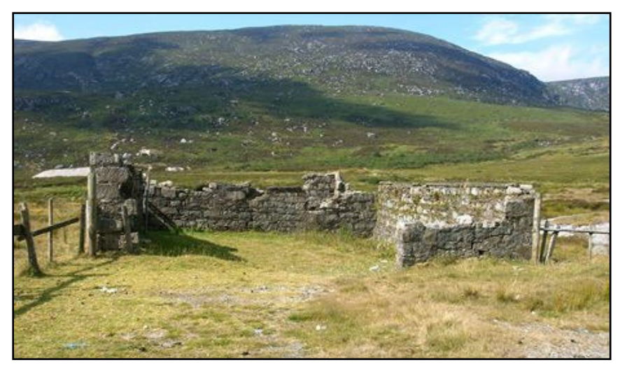
Mine building at Ruplagh.