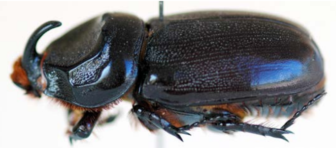
Figure 2. Oryctes rhinoceros male.