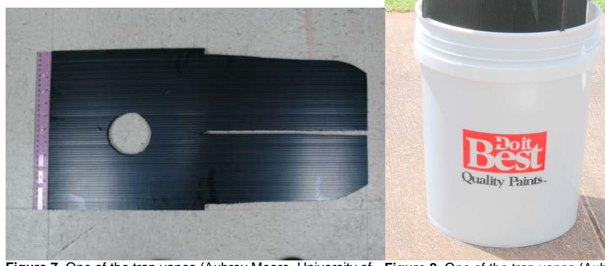
Figure 7. One of the trap vanes (Aubrey Moore, University of Figure 8. One of the trap vanes (Aubrey Guam)