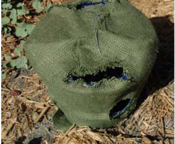
Figure 9. Homemade bucket trap covered with burlap (Image courtesy of Amy Roda, USDA-APHIS).