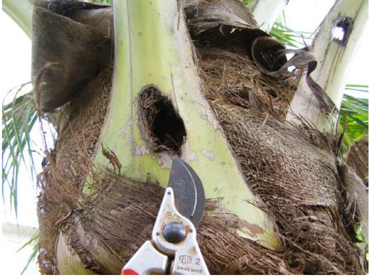
Figure 6. Feeding damage caused by Oryctes rhinoceros.