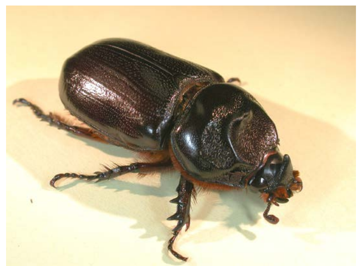
Figure 1. Oryctes rhinoceros female (Mark Schmaedick, American Samoa Community College).

Larvae: Newly hatched larvae are 7.5 mm long (approx. {}^{5}\!/_{16} in) (Lever, 1979). "The large (60 to 105 mm long [approx. 2 {}^{3}\!/_{8} to 4 {}^{1}\!/_{8} in]) white mature larva is C-shaped, with a brown head capsule and legs. The posterior part of the abdomen is a bluish-grey colour" (Giblin-Davis, 2001). Larval instars are