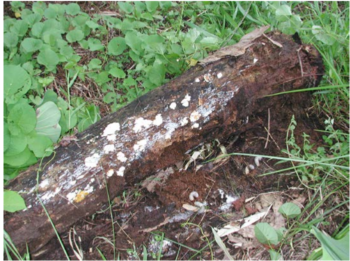
Figure 4. Breeding site of Oryctes rhinoceros under a coconut log (Mark Schmaedick, American Samoa Community College).

Adults mate several times in dead or dying plant material (Catley, 1969), including decaying palm trunks (Zelazny and Alfiler, 1987). The females make a serpentine burrow in which they lay their eggs. According to Hinckley (1973), females can oviposit in "almost any log or heap soft enough for burrowing, yet firm enough to provide compacted frass". Females lay between 3 and 4 clutches of eggs with about 30 eggs per clutch (Hinckley, 1973), laying between 70 and 140 eggs total