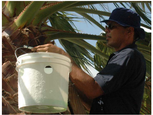
Figure 10. Homemade bucket trap with entrance holes.