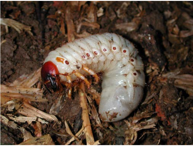
Figure 3. Larva of Oryctes rhinoceros (Mark Schmaedick, American Samoa Community College).