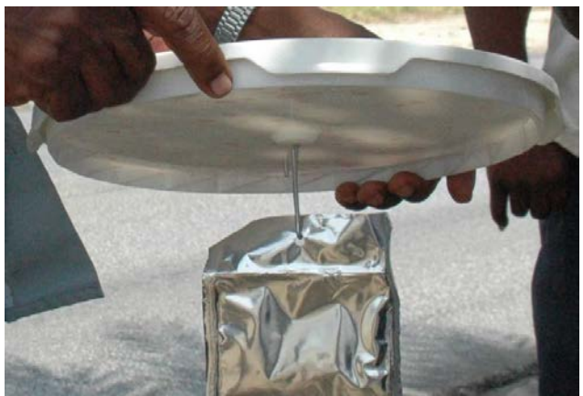
Figure 11. Lid of homemade bucket trap with hanging lure.