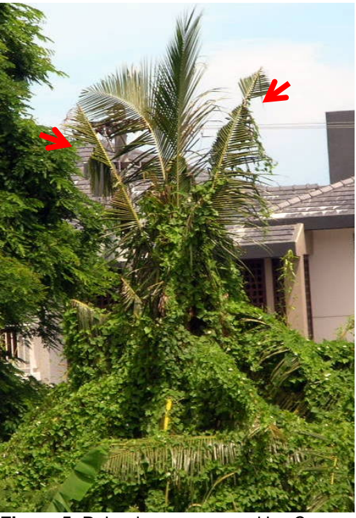
Figure 5. Palm damage caused by O. rhinoceros adults.

There is a positive correlation between abundance of larval food and damage by adults to palms. Outbreaks can be