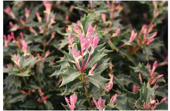
Osmanthus heterophyllus Party Lights.

Another group of painful plants is Osmanthus heterophyllus , holly tea olive or false holly. Versatile landscape plants, they make excellent hedges, screens or specimens and can tolerate sun to shade. When young, they also make great container plants because of their evergreen foliage, bold texture and very fragrant white flowers in the fall. A relatively new variety, Osmanthus heterophyllus 'SPG-3-021' Party Lights™ has extraordinary cream, pink, yellow and white leaves in the spring. The variety 'Sasaba' is compact with unique deeply cut, rich dark green leaves. Ferns, black mondo grass, and heuchera would make excellent supporting plants. And a final container suggestion, one that ties back into ornamental edibles, is blueberries. There are many small, compact varieties perfect for growing in a container. Refer to the Plant Characteristics column of the blueberry table in this article for suggestions. Container soil is much easier to control than garden soil, so if the pH of your soil is not conducive to growing good blueberries, try them in a container!