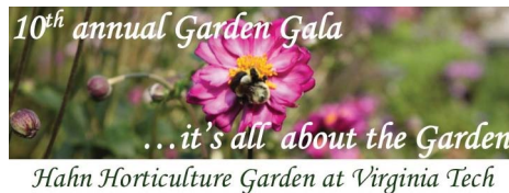
Hahn Horticulture Garden at Virginia Tech