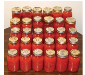
30 quarts of tomatoes from one tiny 4' x 4' garden bed!

Discover nine simple tips to grow large amounts vegetables in small gardens.