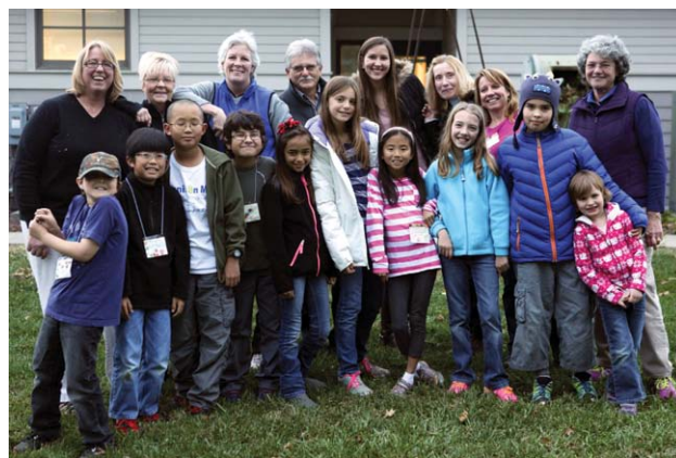
Junior Master Gardeners and volunteers!