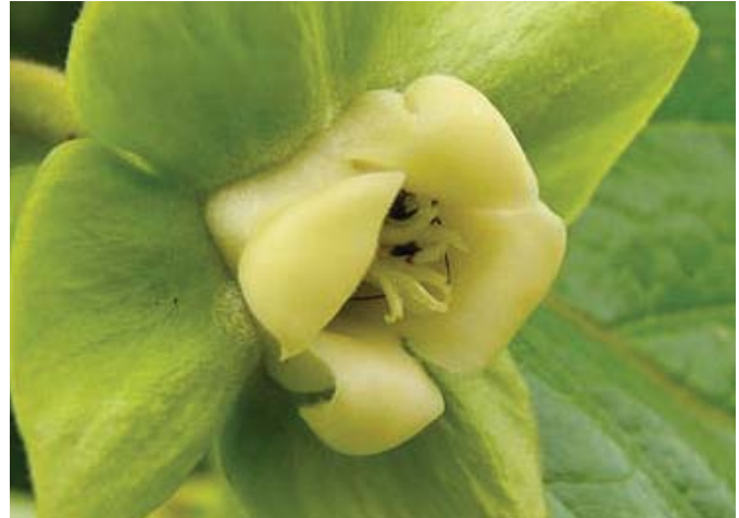
Persimmon flower.

When I think of beautiful shrubby edibles, blueberries are first to come to mind. Super winter structure, interesting bark, small textured leaves, and brilliant fall color that rival the invasive Burning Bush. Blueberries can be used as a hedge or screen, scattered throughout the garden for unity, as accent plants or in containers. Note that for best results, soil pH needs to be 5.7 or lower. Selecting a variety or varieties can be somewhat daunting but there are four main considerations: 1) chilling requirement for fruit set, 2) zone, 3) plant