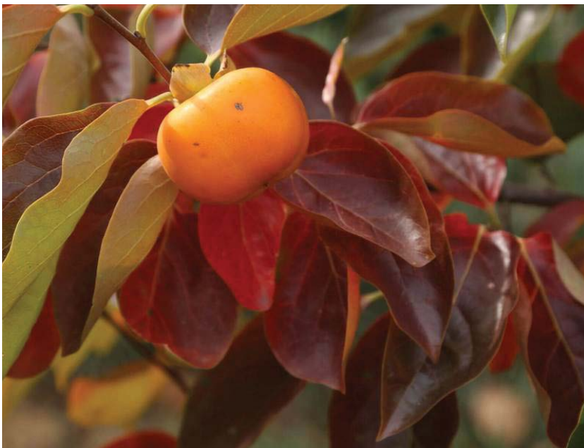
Persimmon fruit and fall color.

Along with Ilex opaca 'Maryland Dwarf' and Quercus alba , there will be many other natives available during the Plant Sale including Hackberry, Celtis occidentalis , with its warty bark and fruit relished by birds; Serviceberry or Sarvisberry as it's called in Appalachia, Amelanchier grandiflora 'Autumn Brilliance', a small, multi-stemmed tree with delicious blue berries loved by people and birds; two selections of Tulip Poplar, Liriodendron tulipifera 'Aureo-marginatum' with variegated leaves, and L. t. 'Little Volunteer', a dwarf; and one of my favorites, Magnolia macrophylla