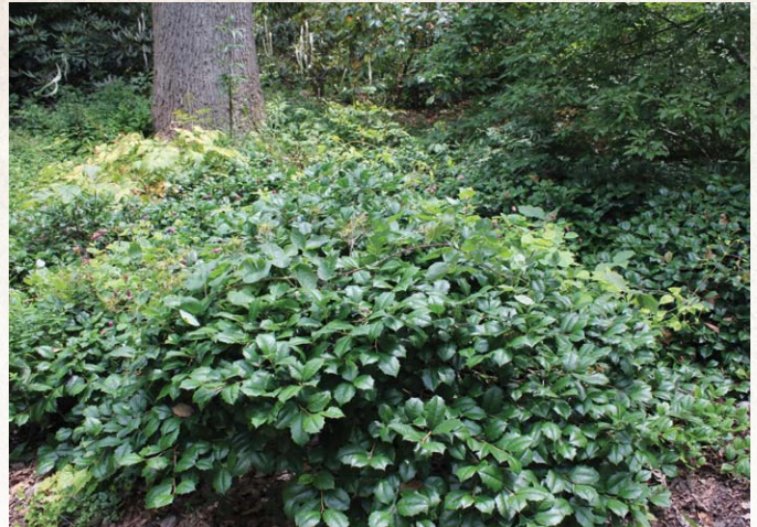
at Mt. Cuba Center