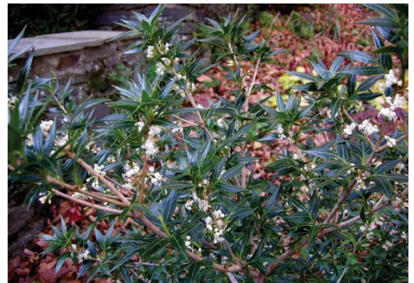
Osmanthus heterophyllus 'Sasaba'.