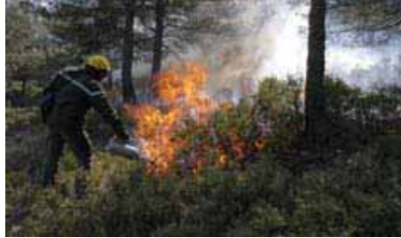
Fuel control by cheep grazing on a strategic fuel break.

Sheep grazing has always been a traditional practice in that part of France. Rural abandonment resulted in a decrease of the grazing pressure in grasslands, shrub