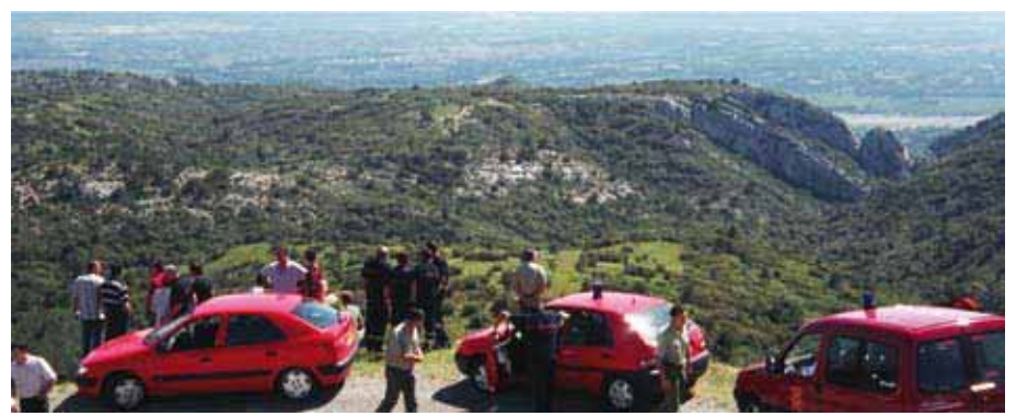
Typical landscape with calcareous steeps and mixed oak / pine forest of Luberon Natural Park