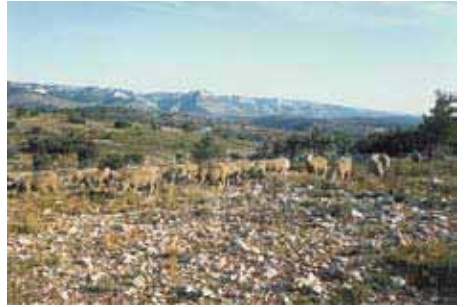
Prescribed burning under Aleppo pine stand in Luberon Natural Park

lands and forest areas leading to fine fuel accumulation. Recent studies have shown the possible renewal of active rangeland management in south eastern France, with the clear objective of wildfire mitigation. Beylier et al. (2006) showed the successful contribution of sheep grazing to fuel control on both a fuel break network and neighbouring areas in the Luberon Natural Park. Renewal of rangeland management combines new establishment of livestock farmers in fire prone areas, together with consolidation of existing animal farming.