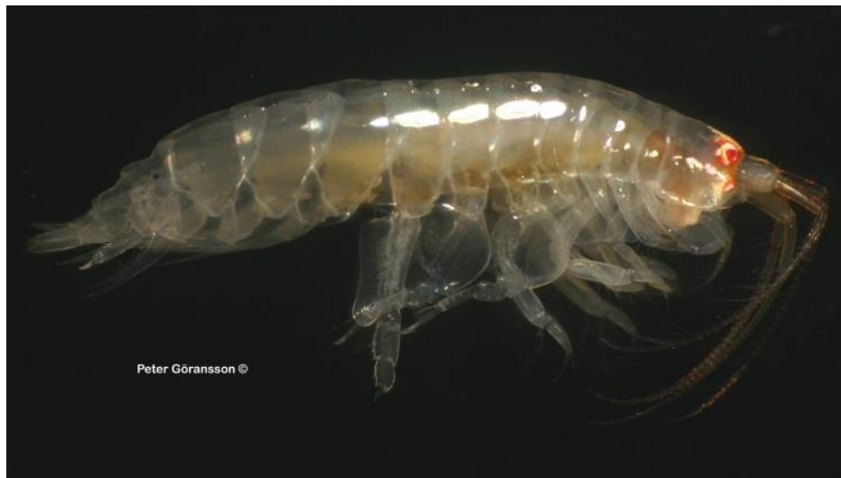
Haploops tenuis .

The main distribution of H. tenuis within the HELCOM area is in the Kattegat and Öresund. Outside the HELCOM area the species is reported from the Skagerrak, the North Sea and the coasts of Western and Northern Norway. Regular monitoring performed by Helsingborg municipality in the Swedish part of the Sound shows a continuous decline of the Haploops community since more than ten years. In 2012 barely any animals have been found at all. There is also a decline in the Skagerrak. The reason for the decline is, however, still unknown. Perhaps eutrophication in combination with increased water temperature plays a role but this is yet to be proven.