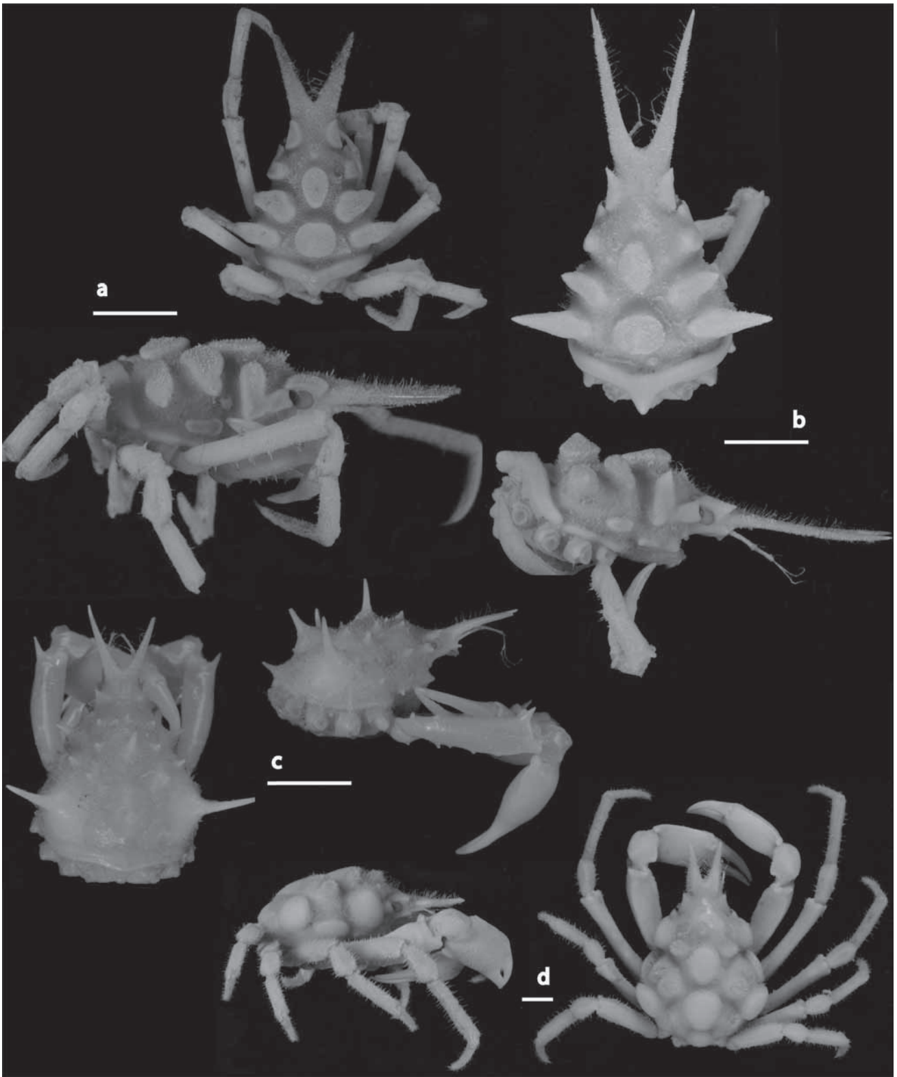
Figure 1. Lateral and dorsal views, scale = 5 mm. a, Oxypheurodon luzonicum (female, NMV J58221). b, Oxypheurodon wilsoni sp. nov. (holotype, WAM C400259). c, Rochinia annae sp. nov. (holotype, WAM C400531). d, Rochinia carinata (male, NMV J53872).