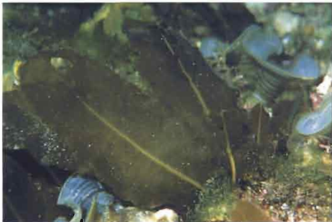
Dictyopteris crassinervia (Ochrophyta)