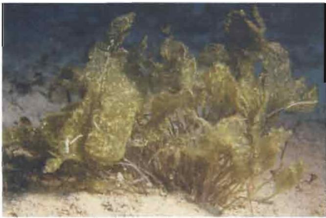
Struvea thoracica (Chlorophyta)