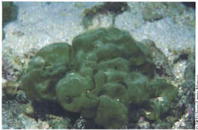
Codium saccatum (Chlorophyta)