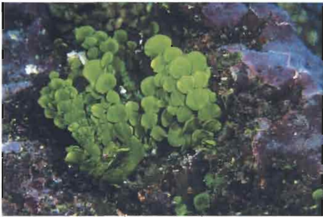
Halimeda discoidea (Chlorophyta)