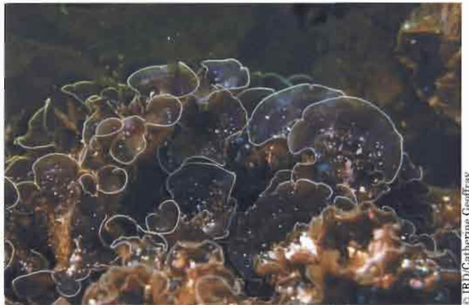
Distromium didymothrix (Ochrophyta)