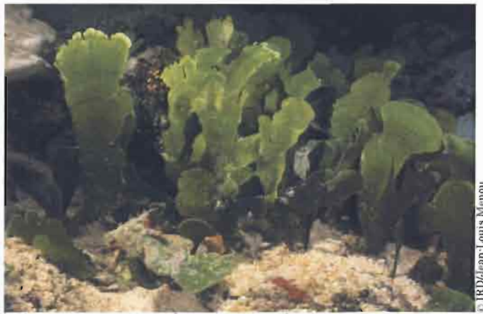
Udotea geppiorum (Chlorophyta)