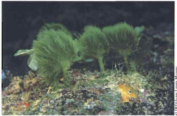
Rhipilia penicilloides (Chlorophyta)