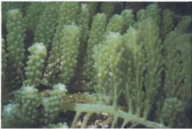
Caulerpa racemosa (Chlorophyta)