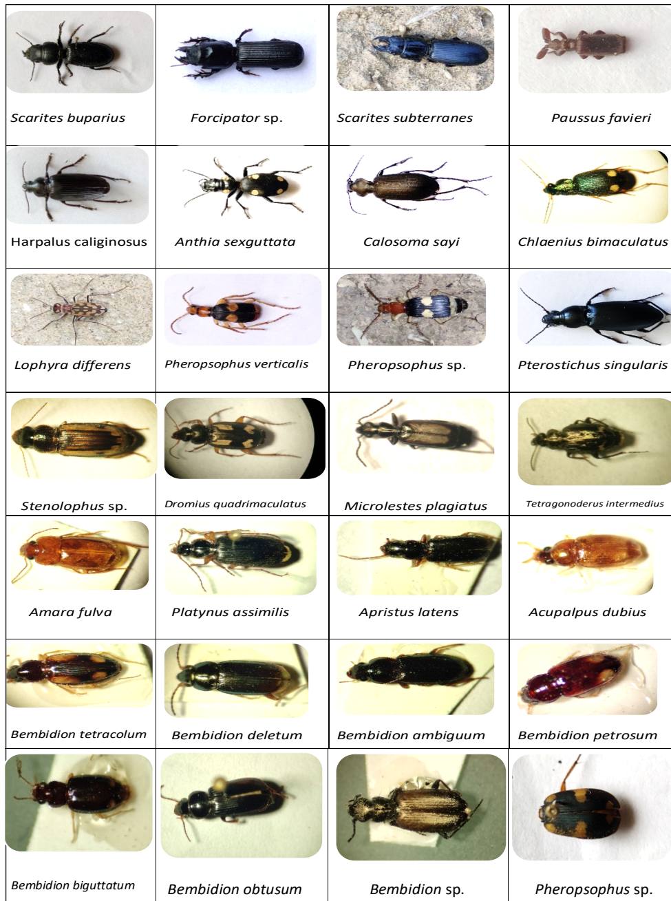
Fig 3: Collected species of Carabidae family of Coleoptera in Jhunjhunu district (four selected sites) of Rajasthan, India from January 2021 to December 2021.

and similar species diversity and species richness. This implies that the availability of different herbs, shrubs, plants and crop cultivars were providing suitable microhabitats for flourished to the diversity and abundance of carabid species. In the previous studies by Gaston, 1991 and Cheng et al. , 2007 revealed that plants and insects interrelate by way of mutualism and phytophagy and the structural intricacy of habitat and diversity of vegetation forms showed correlation with insect species diversity (Alarape et al. , 2015). Beetles are found where there is a favourable environment for their