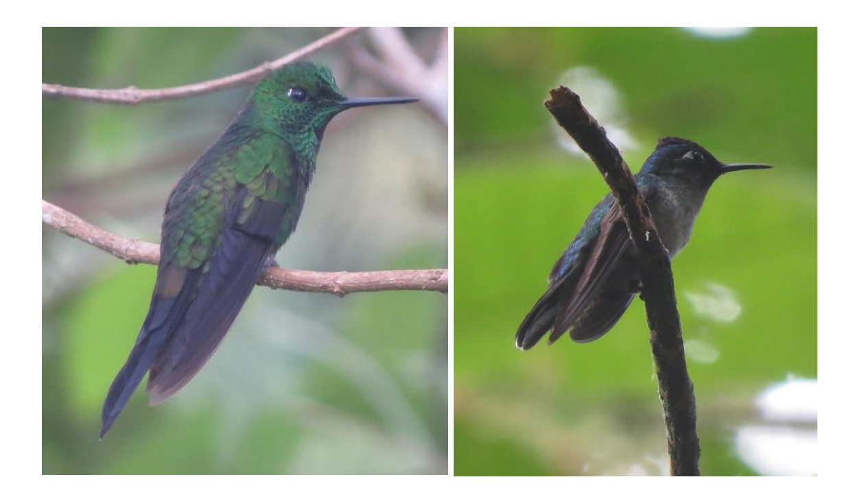
Figure 4. The Green-crowned Brilliant ( Heliodoxa jacula) and the Violet-headed Hummingbird ( Klais guimeti) observed in the Bosque del Tolomuco.