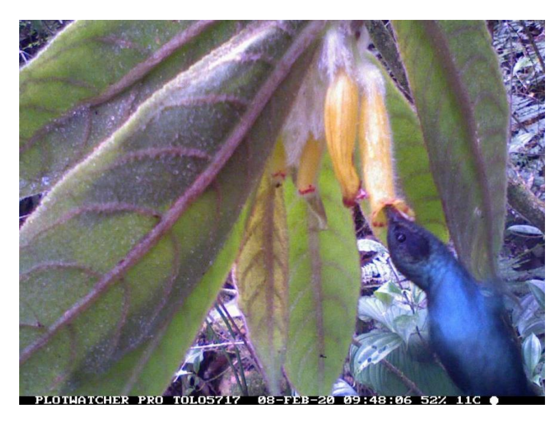
Figure 3. The Green-hermit ( Phaethornis guy ) visiting Columnea polyantha (Gesneriaceae) at Bosque del Tolomuco. Photo: EPHI project.

Figure 2. The Stripe-tailed Hummingbird ( Eupherusa eximia ) visiting Pitcairnia brittoniana (Bromeliaceae) at Bosque del Tolomuco. Photo: EPHI project.