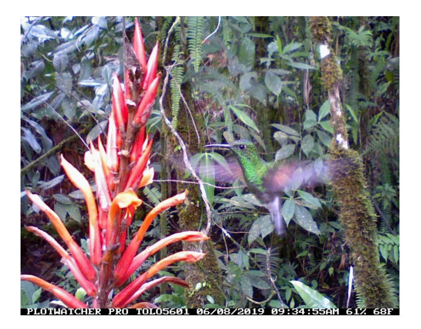
Figure 2. The Stripe-tailed Hummingbird ( Eupherusa eximia ) visiting Pitcairnia brittoniana (Bromeliaceae) at Bosque del Tolomuco.