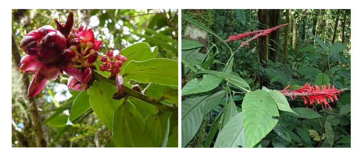
Figure 5. Plant species fitting the ornithophilous syndrome that were visited by hummingbirds in Bosque del Tolomuco: Cavendishia confertiflora (Ericaceae) and Razisea spicata (Acanthaceae).

Figure 4. The Green-crowned Brilliant ( Heliodoxa jacula ) and the Violet-headed Hummingbird ( Klais guimeti ) observed in the Bosque del Tolomuco.