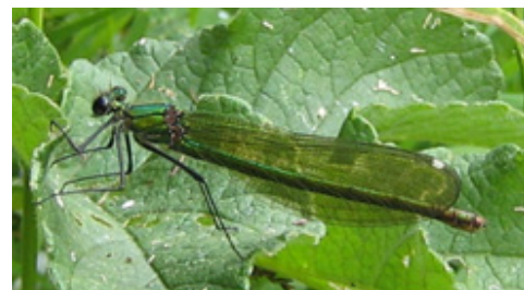
Banded Demoiselle (female)