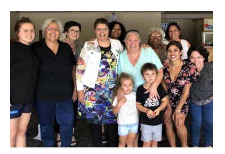
The Ngarrindjeri Women's Choir