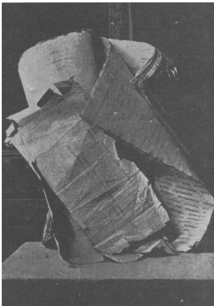
A type-written copy of the Protocols on rice paper circulated in Siberia. It was taken from the 4th edition (1917) of Nilus. There are a number of interesting notes by an unknown editor. Taken to America from Vladivostok in August 1919.