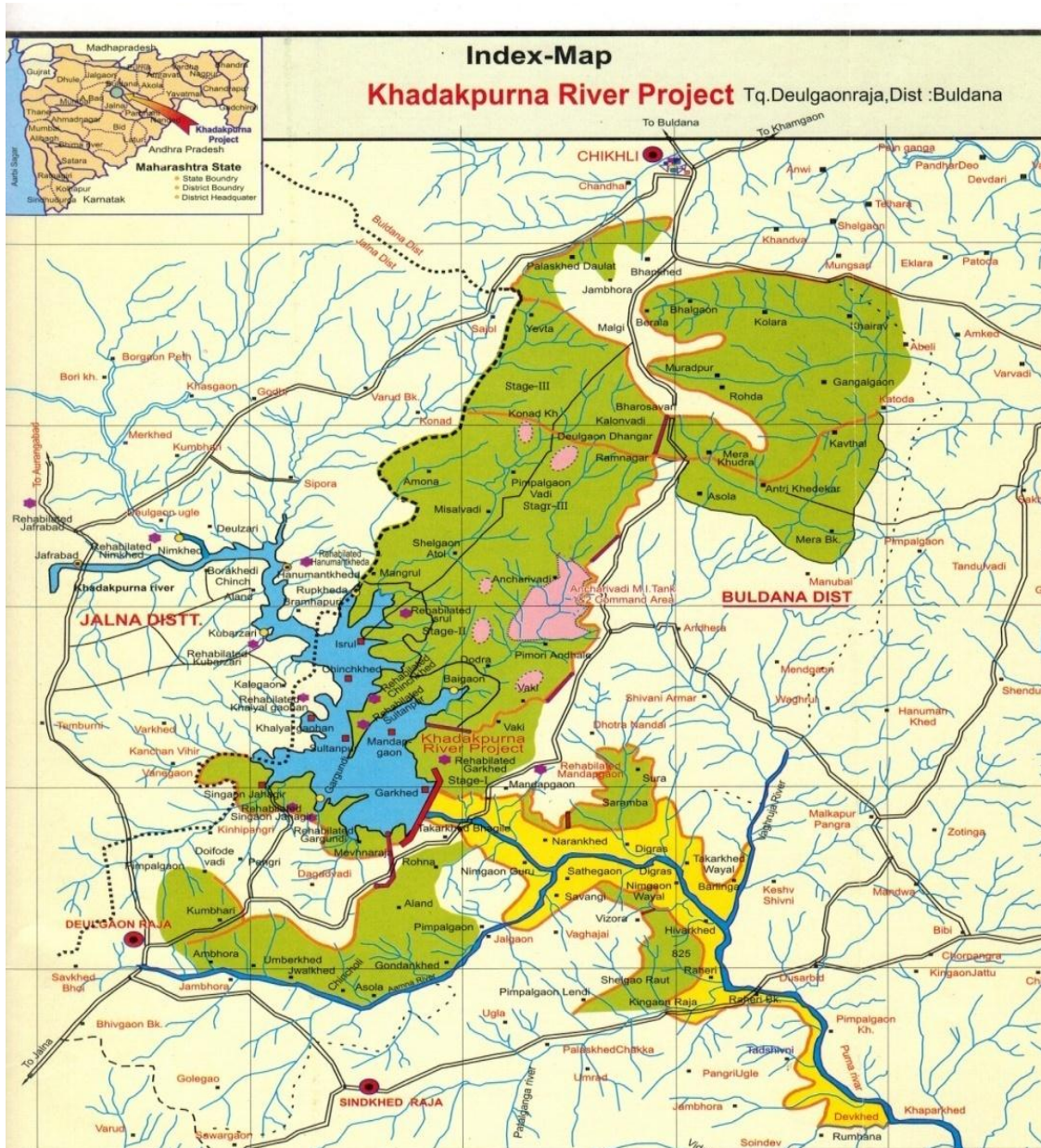
Fig. 1 – Index Map of Khadakpurna Project