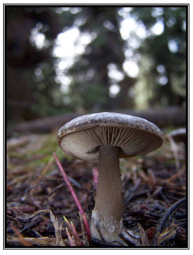
Lyophyllum montanum , is a common spring mushroom found near snowbanks. Photogrpahed 5/25/2008 by Dylan Levy-Boyd in the South Hills, Idaho.