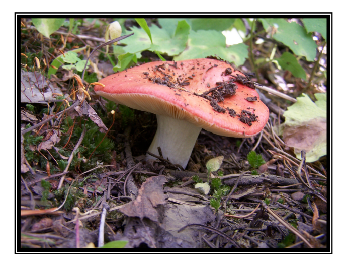
Russulas are mycorrhizal fungi that associate with a slew of hosts. There are upwards of 200 species of Russulas in North America. Identifying them beyond genus is usually quite difficult based on morphological traits alone. Photo 8/13/2008.