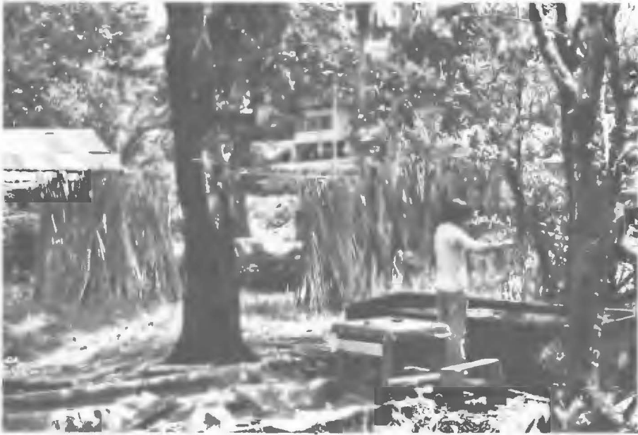
Utilization research will help small rattan businesses such as this one in Kuala Lipis, W. Malaysia, where a trough for boiling "manau" sticks, and stacks of sticks for drying can be seen.

diesel oil in the proportion of 1:2 were found to give high colour value and also to improve tension qualities and reduce the moisture content. Increased temperature and time of boiling lowered the physical and mechanical qualities but not the colour.