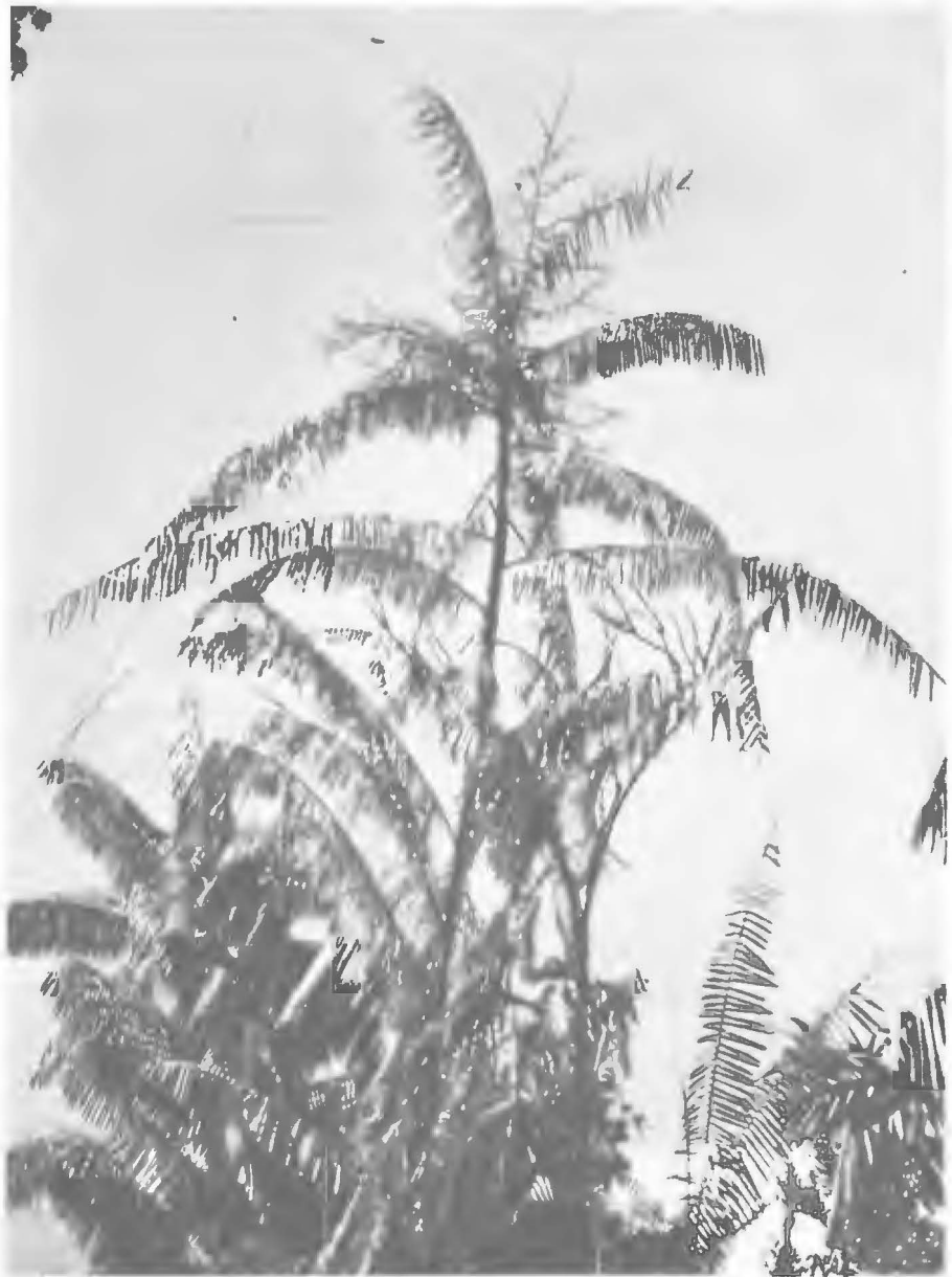
Calamus erinaceus growing just landward of a mangrove forest in Jason Bay, Johore, W. Malaysia.

In the Philippines, the Philippines Reforestation Administration attempted to grow rattan in the Magat Reforestation Project, Diadi, Nueva Viscaya, but had little success (110). Thailand made an attempt in the late forties to establish C. caesius plantations in Narathivat, Patani (113), but again there was little success. Attempts to establish plantations resumed in 1968, with the government requesting that 80 ha be planted yearly.