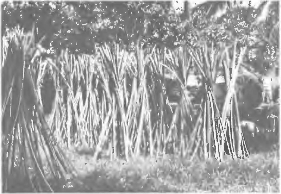
Manau sticks drying after treatment in Kuala Lipis, W. Malaysia.

The proportion of coconut to diesel oil or palm oil in the mixtures varies virtually from depot to depot as do immersion periods and oil temperatures. There is no rational explanation for these variations, except that each depot chooses its immersion times, temperatures, and “strength” of mixture, either according to the dictates of its customers or according to its own judgment through experience. The size and species of cane to be treated also influences these choices.