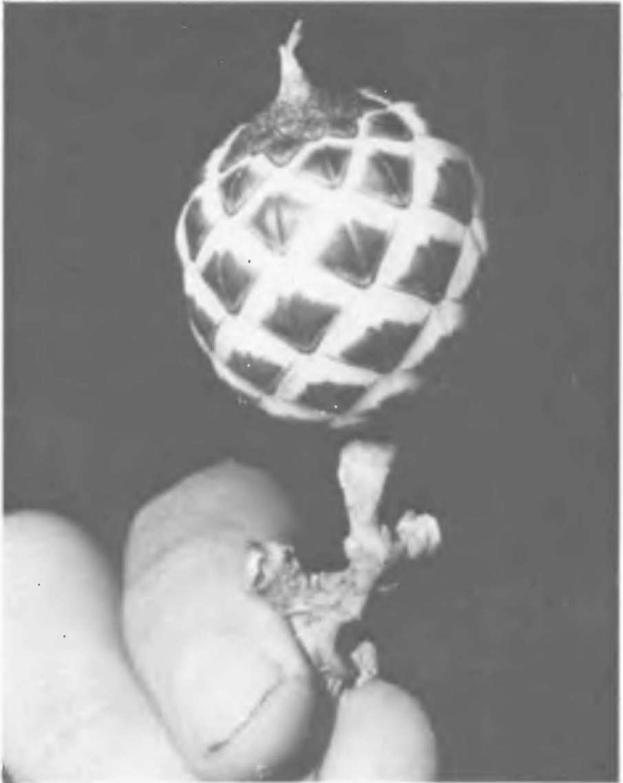
Rattan fruit are covered with overlapping scales. This species, Daemonorops lasiospatha , has sweet tasty flesh.

The following account of the planting technique for C. trachycoleus largely emerged from a discussion I had with a very enthusiastic group of planters at Dedahup in 1978.