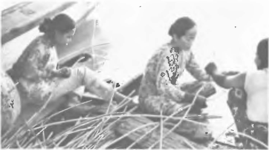
“Rotan sega” (Calamus caesius) being cleaned with sand in preparation for further processing (Jambi, Sumatra).

Large-diameter canes like C. manan , C. ornatus , and C. scipionum are used whole for various purposes such as furniture frames, sports goods, and numerous other uses. The traditional method of bending the canes is by heating with fire, either by using a blowtorch directly on the part to be bent or by applying the heat indirectly with a piece of heated metal (preferably a soldering iron). In both methods, care is taken not to burn the skin of the rattan too severely. Heated and bent rattan is left in a mould to take the required shape and removed on cooling. This process is difficult to control and standardize and is labour intensive.