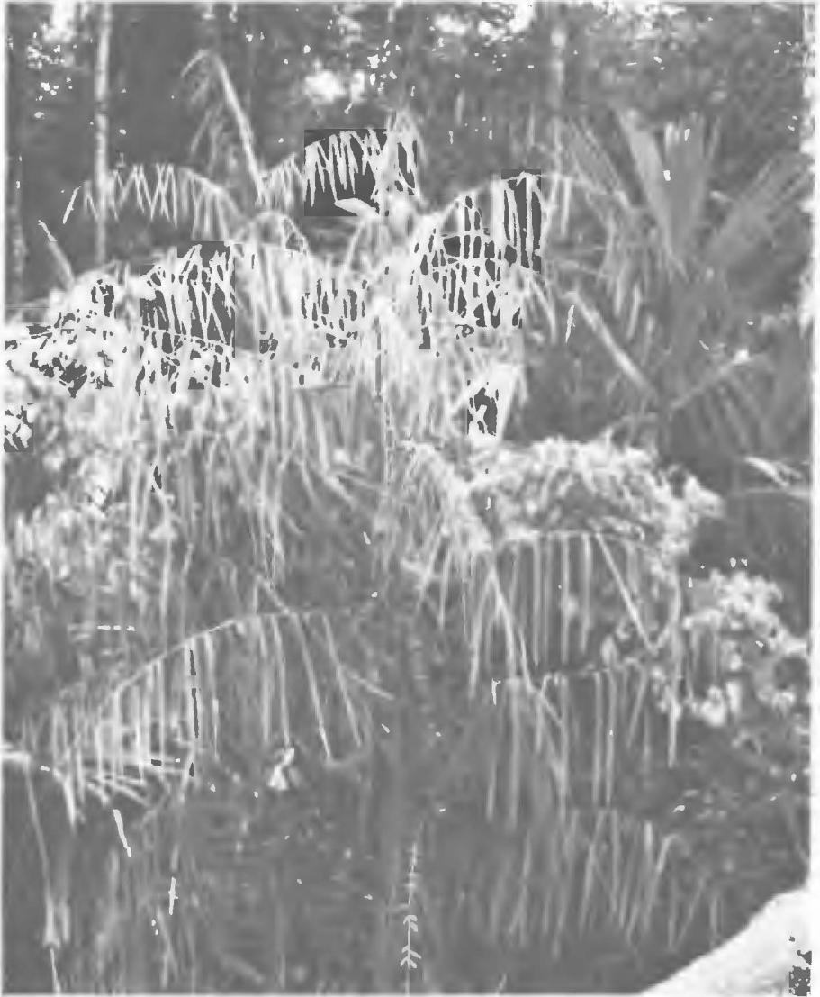
A group of Daemonorops mirabilis in selectively logged forest in Balikpapan, Kalimantan, Indonesia.

Dransfield (59) gives a concise and simple account of the stems, roots, leaf sheaths, leaves, climbing organs, inflorescences, flowers, and fruits of the rattan plant, noting important variations in their character.