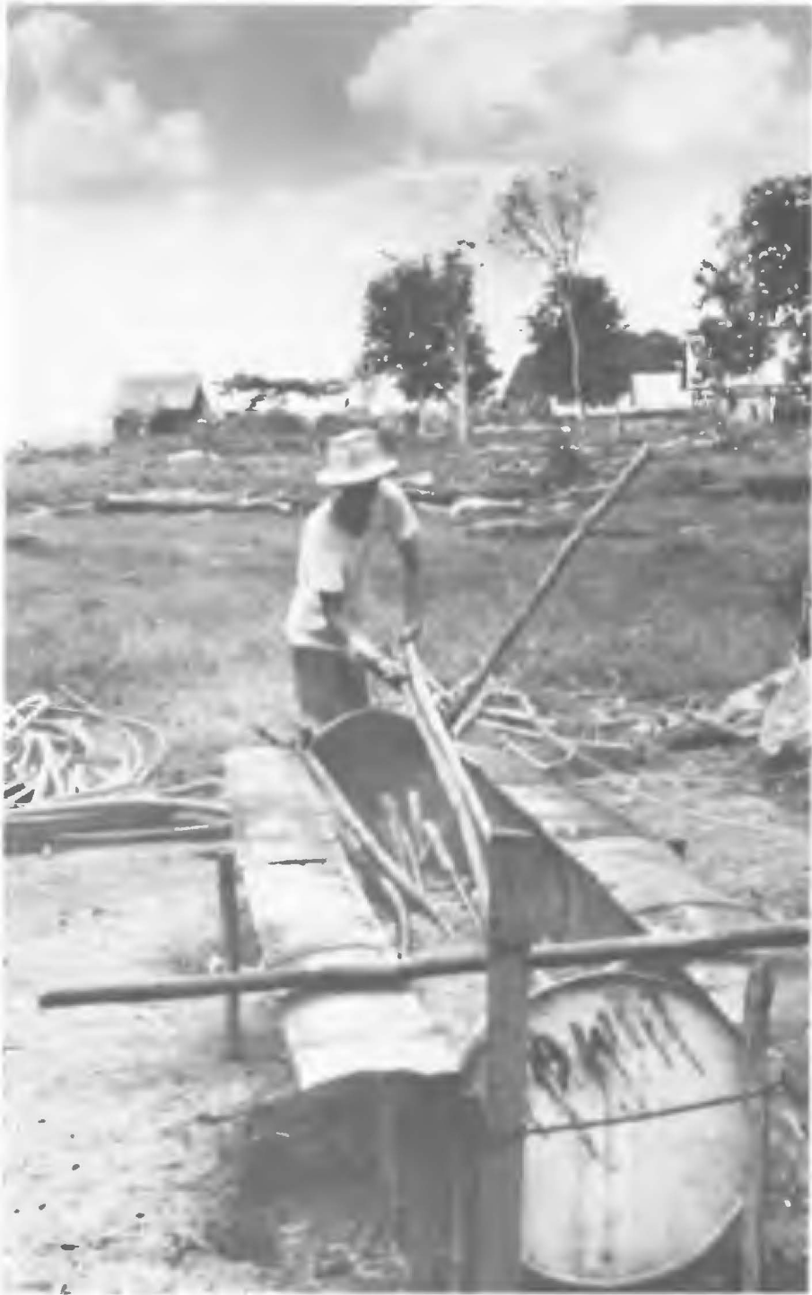
A trough partially filled with diesel oil for treatment of "manau" sticks in Jambi, Sumatra.