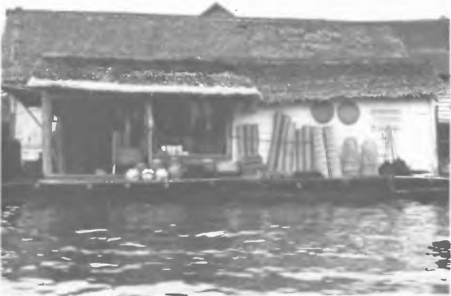
A shop beside a canal in Banjarmasin, Kalimantan, Indonesia. Shops like this sell a wide range of domestic articles made from rattan, such as fish traps, baskets, mats, and brooms.

However, Singapore is concerned mainly with the processing and conversion aspects, preparing the canes for direct use in manufacturing and then exporting them to nearly 60 countries of the world: Italy, Taiwan, the United States, the Federal Republic of Germany, Hong Kong, Spain, and France take 70% of her exports. In 1977 Singapore earned more than U.S.$21 million from processed and converted (but not manufactured) rattan exports. A direct comparison with the value of raw rattan imports is not possible because available statistical data do not show the substantial imports from Indonesia. Discussions with importers indicate that about 90% of Singapore's supplies come from Indonesia. The value of the remaining imports was slightly more than U.S.$1 million, meaning that total imports for 1977 would have amounted to about U.S.$10 million. Hong Kong imported more than U.S.$26 million worth of rattan and rattan products and exported more than U.S.$68 million. Imports from Indonesia