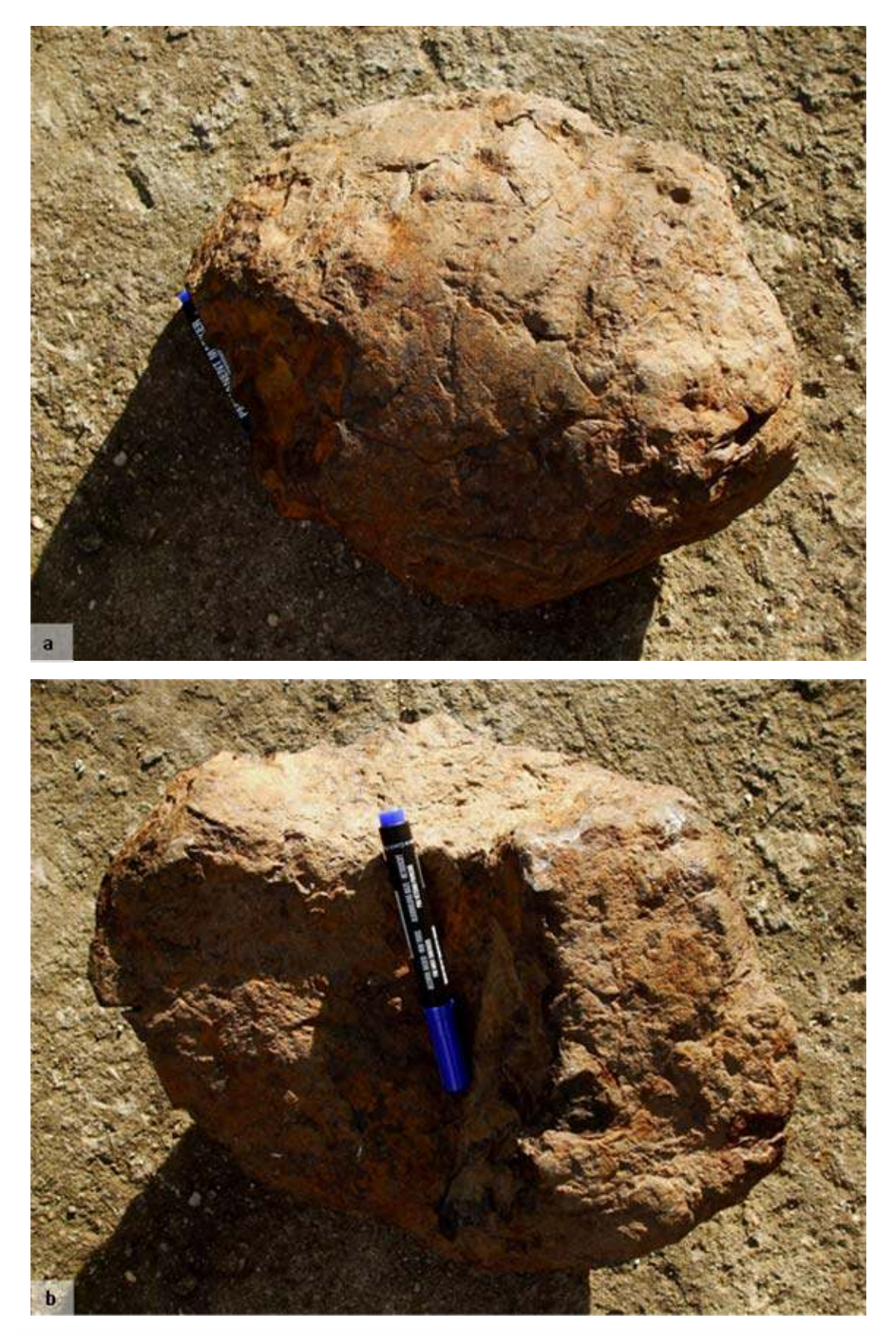
Fig.1. Photographs of the Gresia meteorite. The inferred places of the three missing fragments can be seen, one in (a) and two in (b). The place from which the studied sample was cut can be seen in (b, left side).