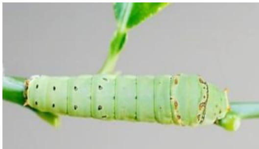
Figure 7: P. dempleus (Host of C. sunflowari )