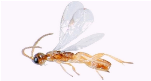
Figure 5: C. flavipes