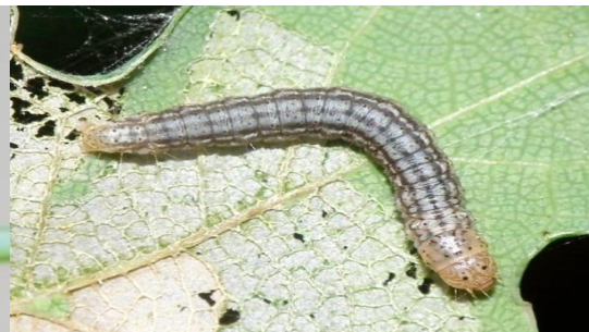
Figure 8: Pyralidae (Host of G. melentis )