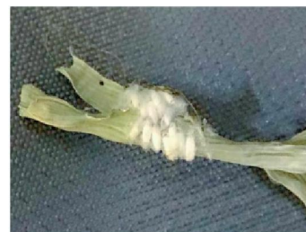
Figure 2: C. ruficrus Cocoons