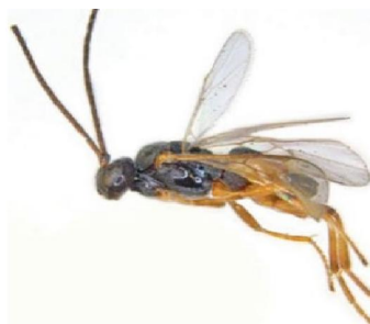
Figure 1: C. ruficrus