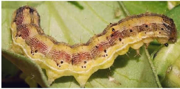
Figure 3: H. armigera (Host of C. ruficrus )