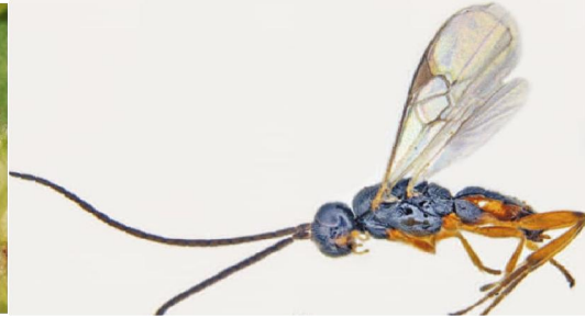
Figure 4: C. rucicrus