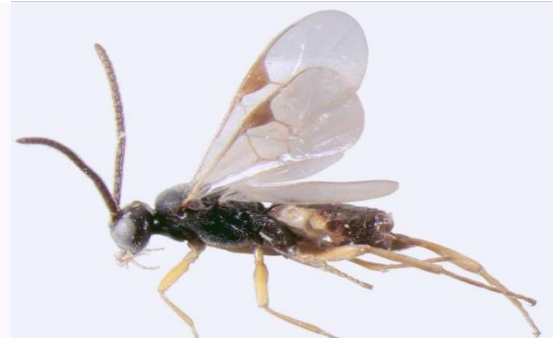
Figure 6: C. Cameron