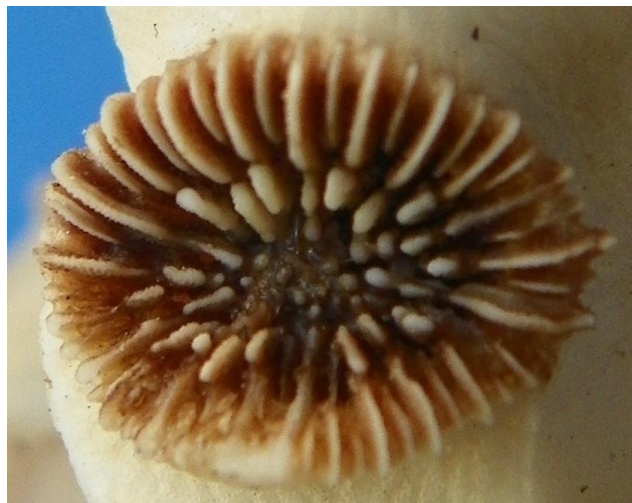
Fig. 3. Cyathelia axillaris : Oval corallites.

The description of the species is based primarily on Cairns (1994). Coralla sparsely branched, resulting in small, robust, bushy colonies, the largest known about 11.6 cm in height, supporting approximately 75 corallites (Fig.2). Branching is essentially sympodial, but two buds often originate on opposite sides of a terminal corallite, the parent corallite ultimately becoming immersed in thick coenosteum within the branch axil. Corallites circular when small, often becoming elliptical to rhomboid (Fig. 3) or even medially constricted if located at a branch axil. Corallites relatively large, up to 13 mm in GCD and smallest being 4 mm in GCD. Branch coenosteum dense, granular, light brown to tan in color, and usually faintly costate. Corallites often pigmented a darker shade of brown. Septa usually hexamerally arranged in 4 cycles. Thick pali, wide, form a palmar crown encircling columella. Pali and septal faces highly granular. Columella papillose.