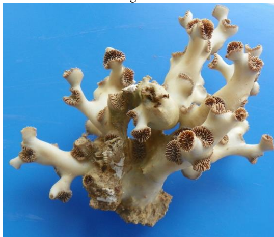
Fig. 2. Cyathelia axillaris : Specimen collected from offshore waters of Sindh.