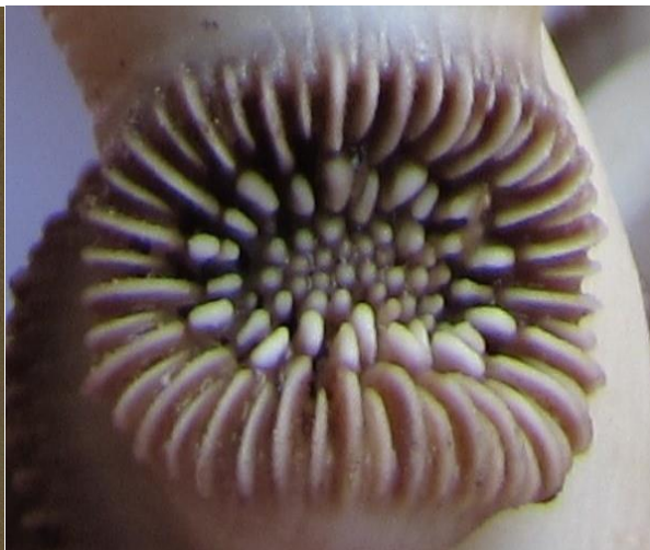
Fig.4. Cyathelia axillaris : Rhomboid corallites.

Distribution: Type Locality: Eastern Indian Ocean (Ellis and Solander, 1786). Now known from Japan and Moluccas (Cairns, 1994), Indonesia and the Philippines (Cairns and Zibrowius, 1997), Arabian Sea and Bay of Bengal (Alcock, 1898; Pillai, 1972), Australia (Cairns, 2004).