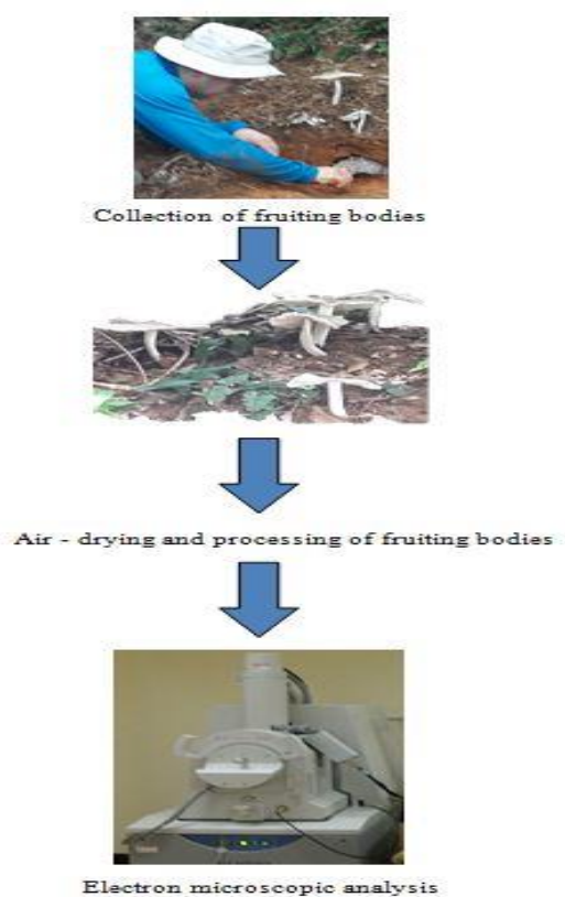
Figure 1. Flowchart in the collection and processing of T. intermedius samples for elemental analysis

Mushrooms in general are good sources of minerals [8] [9] [10] [11] in addition to their antihypertensive, antidiabetic and anticancer properties [12] [13] [14] [15]. Recently, we have investigated the antioxidant activities of mushrooms [16]. For the first time, the elemental composition within the fruiting body of Termitomyces intermedius was elucidated in this study. Based on our investigation, we found out that nitrogen (N), oxygen (O), magnesium (Mg), silicon (S), phosphorus (P), sulphur (S), potassium (K), iron (Fe) and calcium (Ca) are distributed in the different parts of its fruiting body. The