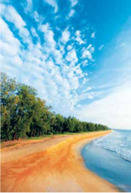
Ko Phra Thong