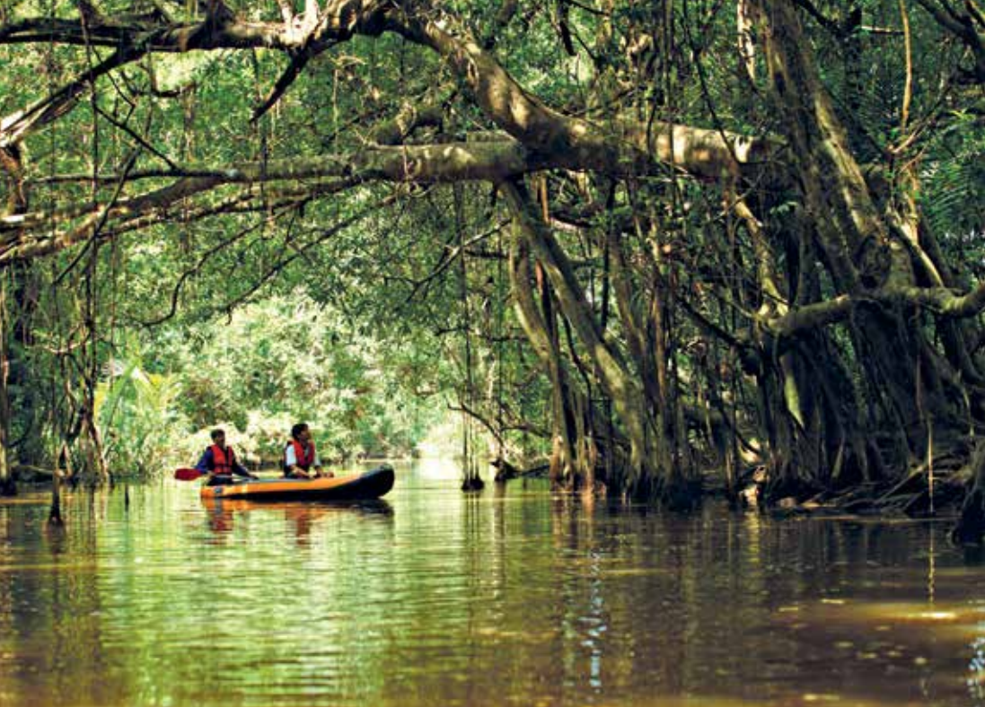
Khlong Sangne or Little Amazon