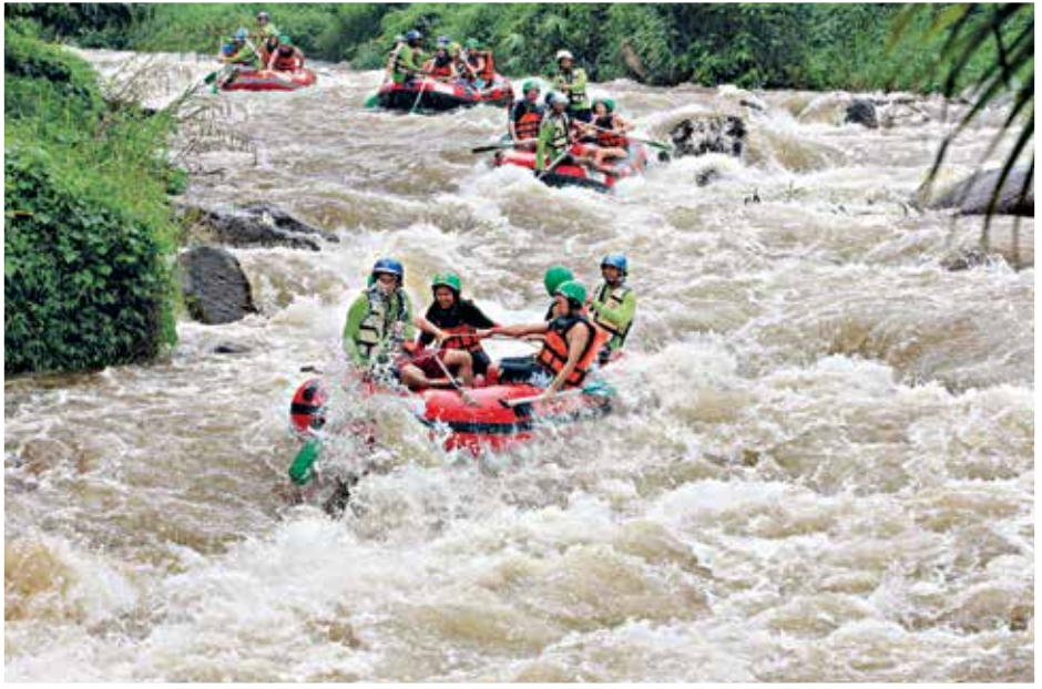
Song Phraek Rafting

provides a 2-kilometre nature trail with Bua Phut – Rafflesia kerrii , a plant species with the world's largest flower of approximately 80 centimetres in diameter, along the route. The plant grows as a parasite on the root of a vine known as Yan Kai Tom. Its flower has 5 reddish brown petals. It is rare and to be found only in a fertile forest. It blooms towards the end of the rainy season around October. Along the route, there are traces of old mines, bird-watching spots that indicate the fertility of the forest, Namtok Hin Phoeng which is a watershed, etc. A guide is needed for trekking along the trail, which takes about 1 hour. At present, a package tour is offered by travel agencies to include trekking on an elephant's back through intact forests along both sides of the