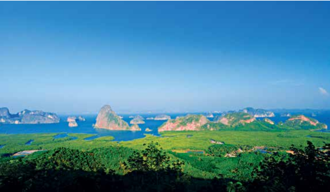
Ao Phang-nga National Park