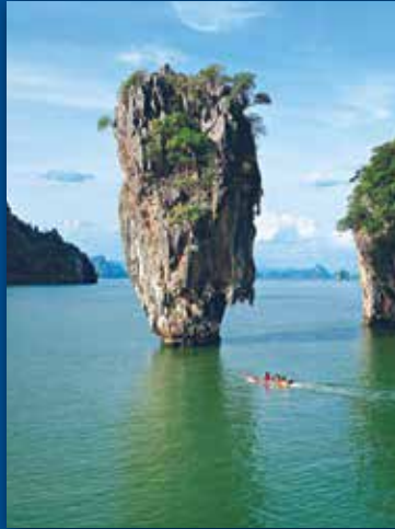
Ao Phang-nga National Park