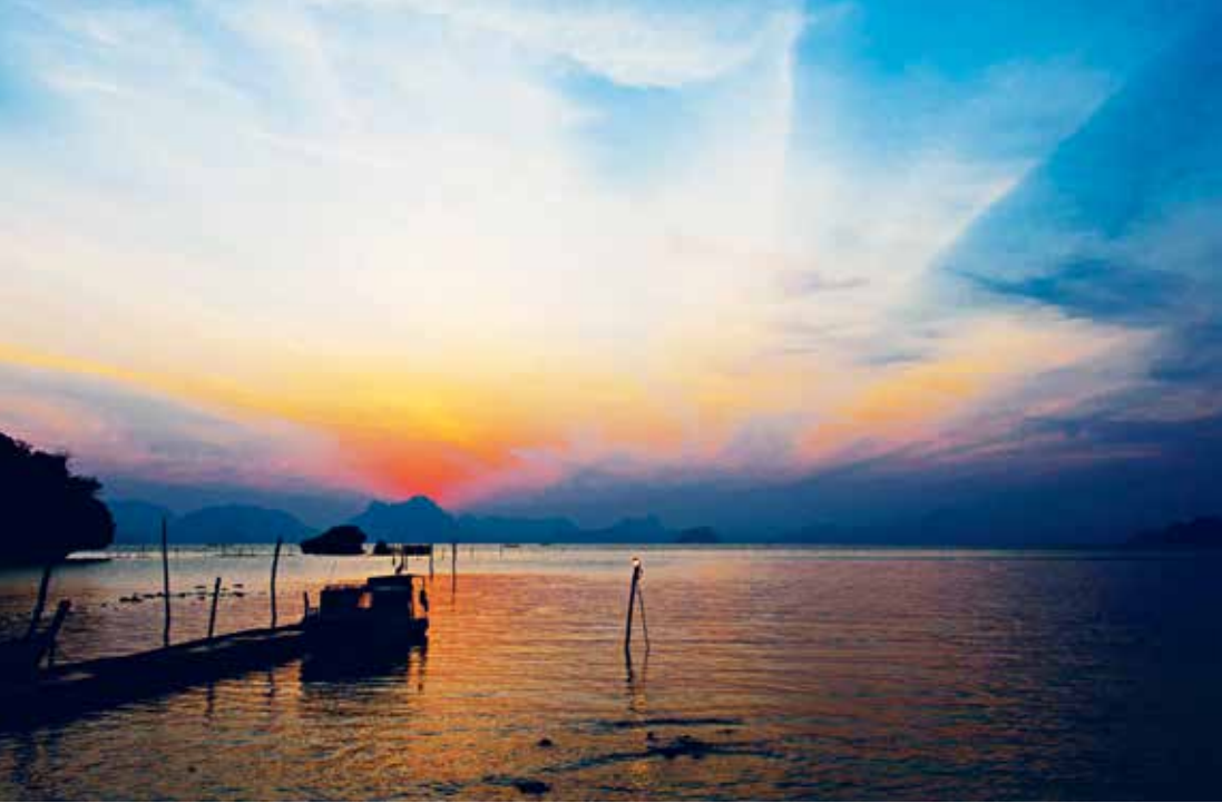
Ko Yao Noi

Ao Khlong Son (อ่าวคลองสน) is on Ko Yao Yai and offers a clean white shady beach with pine trees. To the left, there are rocks and pebbles of beautiful colours. The inlet is suitable for swimming and diving to admire the coral reefs.