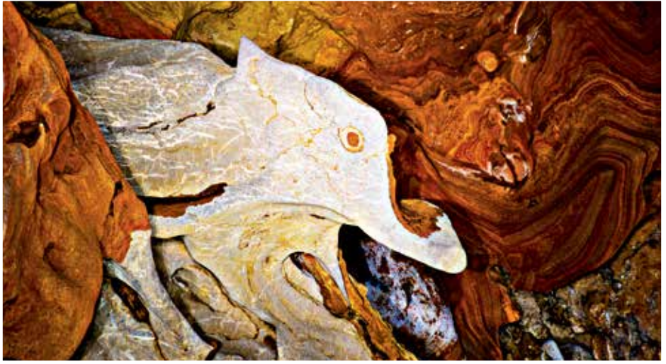
Tham Phung Chang

and canoe in order to get inside to admire the naturally-created stalagmites and stalactites, which are of various amazing shapes not to be seen anywhere else. Among the magnificent formations are the ones that feature hundreds of elephants walking one after another to form a circle, an elephant sitting under the Chatra umbrella, and a golden ladder that sparkles in the light. The air inside is cool and well-ventilated. Visiting Tham Phung Chang will take approximately 1.30 hours. Interested visitors may contact the Thong Thae Sea Canoe Company Limited at Tel. 0 7626 4320, 0 7641 2292, 08 6683 6844.