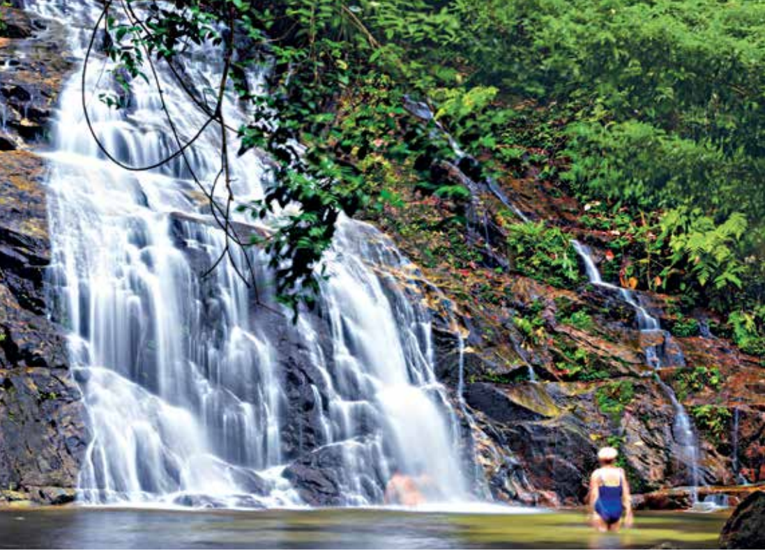
Namtok Ton Chong Fa

Khlong Bang Niang and cascades down into a 5-tiered waterfall, with water running all year. Its surrounding area is shady and provides home to rare animals like Malayan tapir, hornbill.