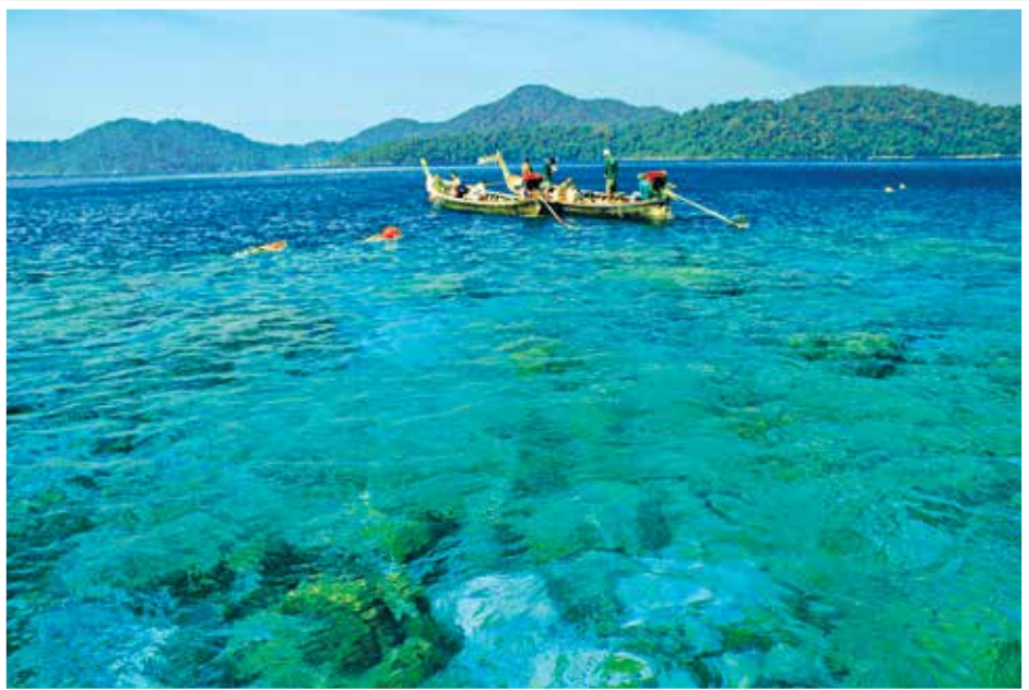
Ao Mae Yai