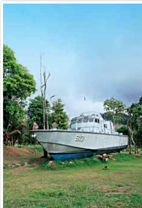
Tsunami Memorial Park

at Ban Nam Khem is constructed in an area of approximately 5 rai. Two walls were built along the memorial walkway. One side features wave-like curves with a black terrazzo surface. Visitors can look through the holes to see the fishing boat damaged by the tsunami. The other