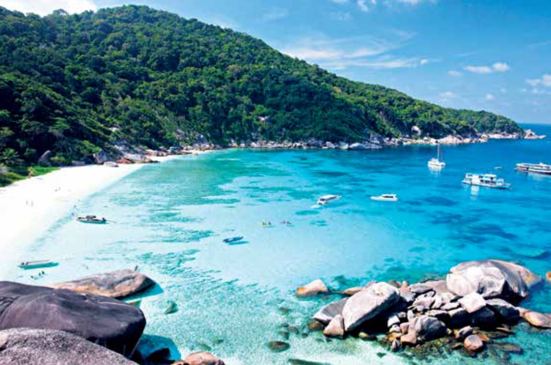
Muko Similan National Park

Department Tel. 0 2562 0760, or visit www.dnp.go.th .