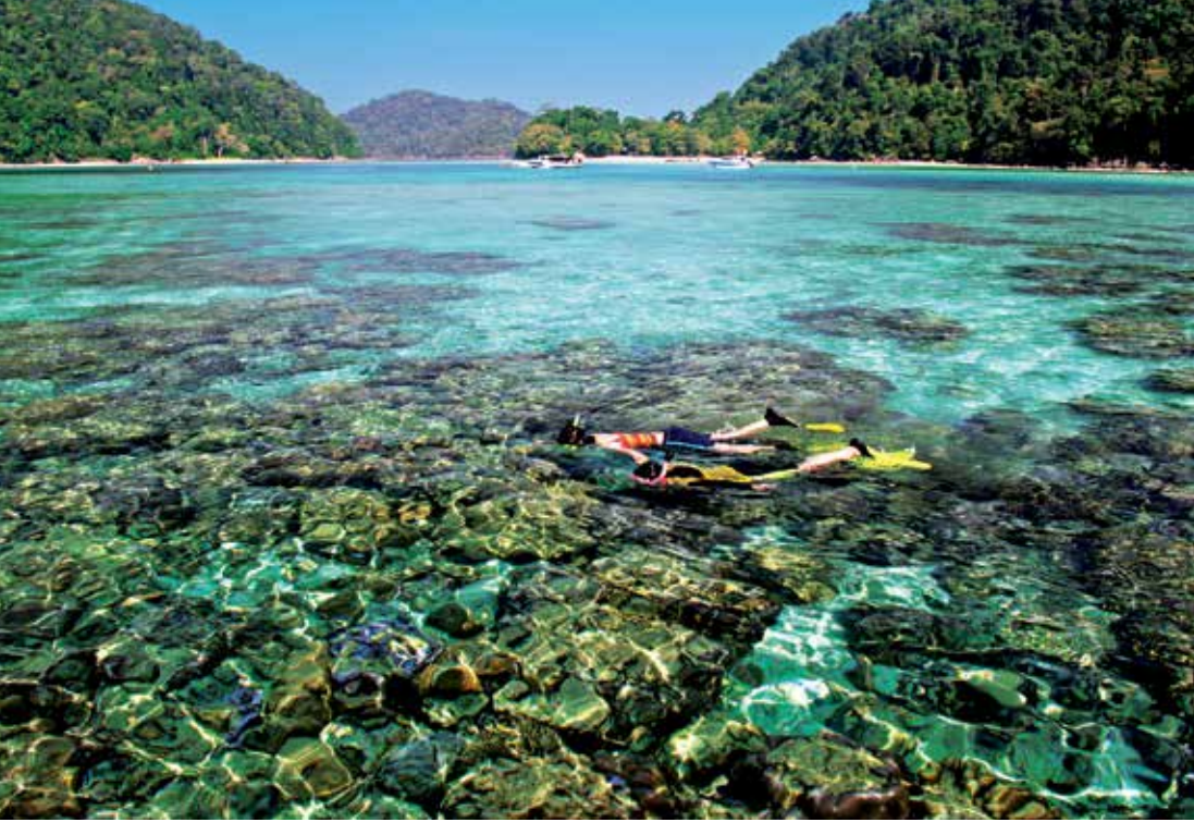
Muko Surin National Park

nga Bus Terminal, or the Bangkok–Surat Thani or Bangkok – Ranong bus, to Lam Kaen T-junction. Then, take a motorcycle to the pier.