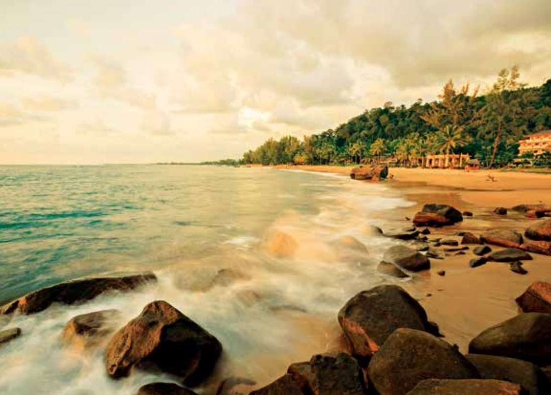
Khao Lak Seaside