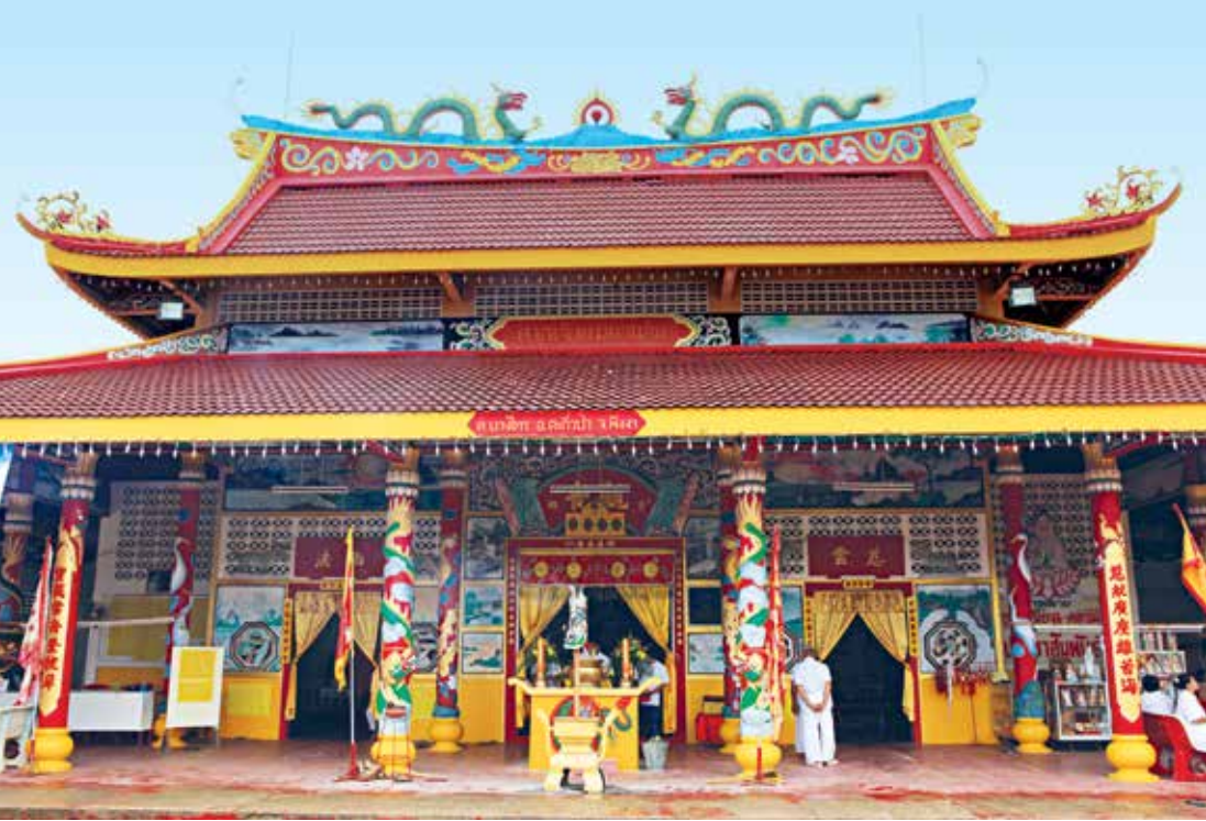
Phang-nga Vegetarian Festival

feature forests and orchards on both sides. Visitors may freshen themselves up by jumping into the water that is surrounded by a green environment. Rafting is available all year. For more information, please contact Eco Khaolak Adventure at Tel. 0 7648 5586-7.