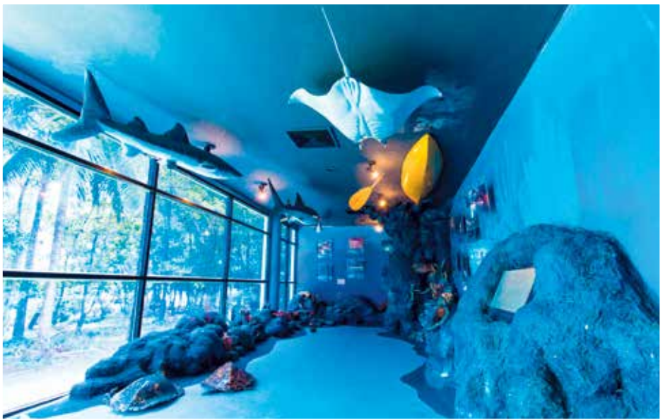
Chulabhorn Marine Park Conservatory Centre

Chulabhorn Marine Park Conservatory Centre (ศูนย์อนุรักษ์พันธุ์อุททยานใต้ทะเลจุฬารภรณ์) is situated inside the Third Fleet of the Royal Thai