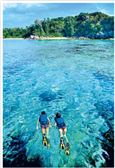
Snorkelling in Muko Similan National Park

covers a total area of 128 square kilometres (80,000 rai) in Tambon Ko Phra Thong and was proclaimed a national park on 1 September, 1982. The word “Similan” is in Yawi or Malay, meaning Kao or nine, referring to an archipelago of 9 islands. Similan is a small archipelago in the Andaman Sea comprising a total of 9 islands lying in the North – South direction, including Ko Huyong, Ko Payang, Ko Payan, Ko Miang (twin islands), Ko Payu, Ko Hua Kalok (Ko Bon), Ko Similan, and Ko Ba-ngu. The Park’s