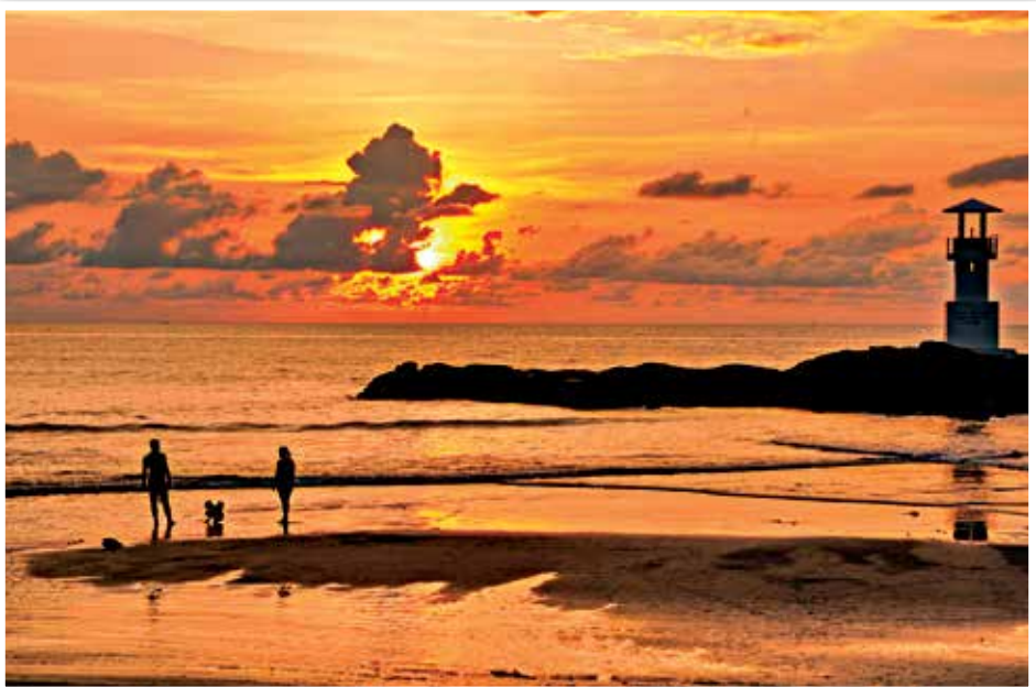
Khao Lak-Lam Ru National Park