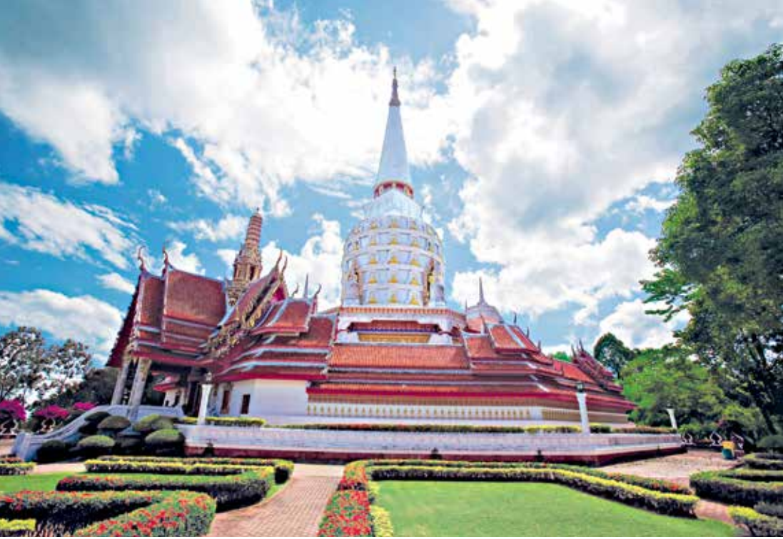
Wat Bang Riang

The original Rama and Lakshmana images are now exhibited at the Thalang National Museum, Amphoe Thalang, Phuket. In addition, an inscription stone of 1,300–1,400 years old was unearthed on top of Khao Riang inside the temple's precincts. These sculptures are related to the historical background of "Takola" (Takua Pa) and the introduction of Indian culture into this region.