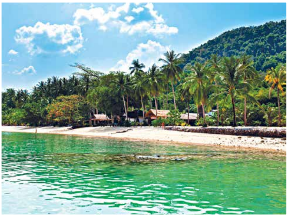
Hat Tha Khao

Ao Ti Kut (อ่าวตีกูด) is on Ko Yao Yai and features a clean white beach. To the north, there is a cape with beautiful scenery. The shore is shady with pine trees.